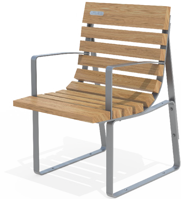
Bilateral Chair 600L