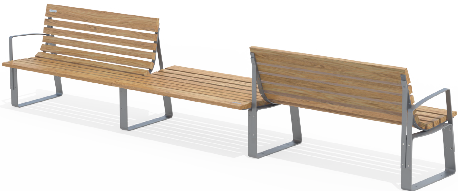
Bilateral Double Seat & Bench 4620L