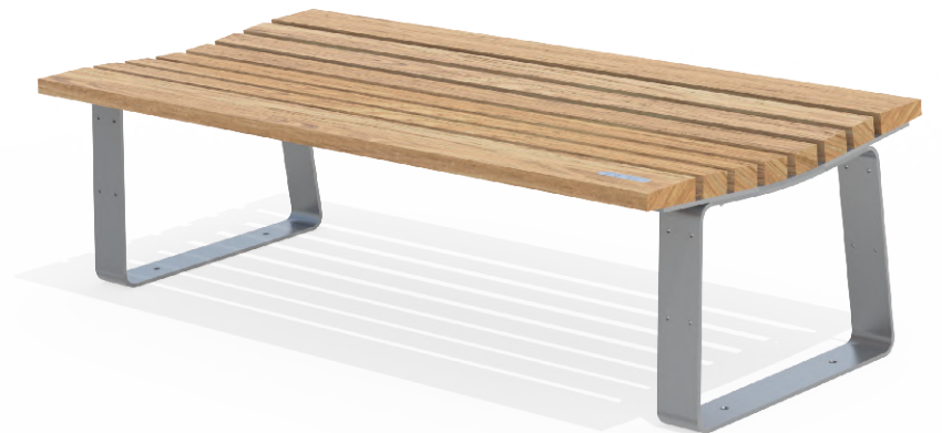
Bilateral Bench 1600L