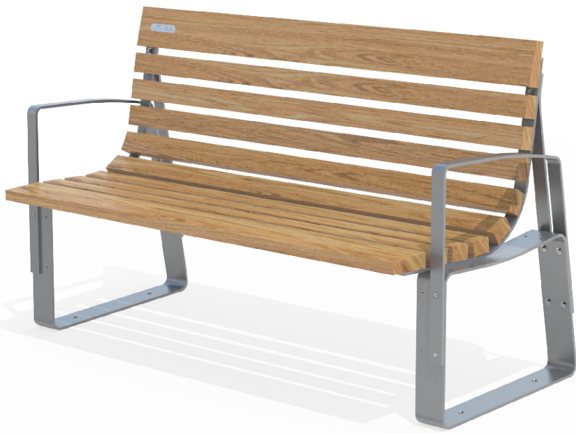
Bilateral Seat 1600L