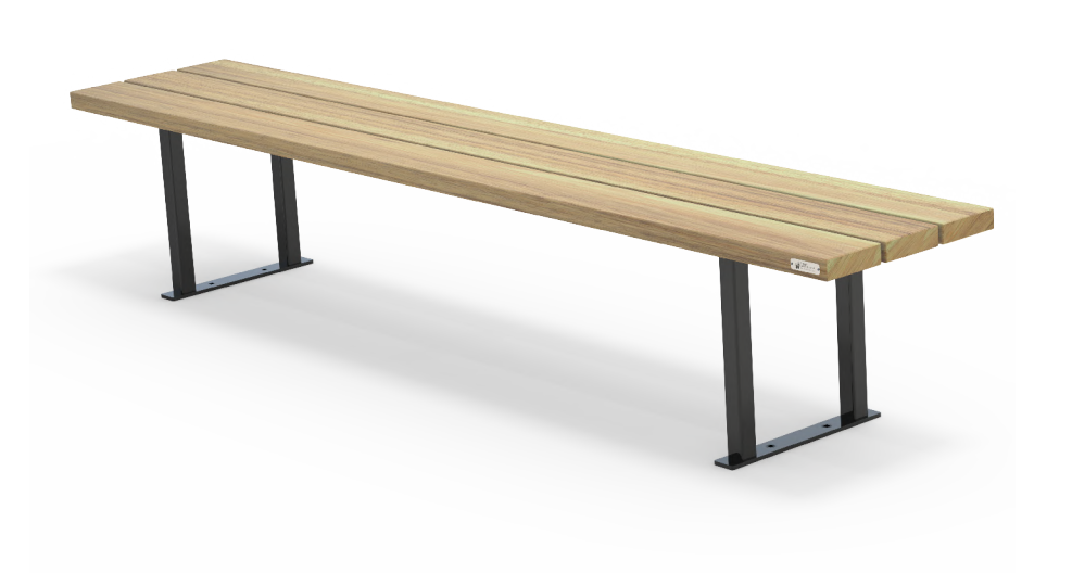
Boulevard Bench 1800L & 2400L