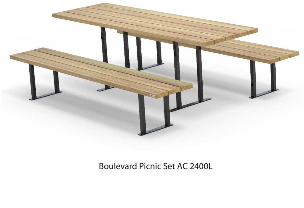
Boulevard Picnic Set AC 2400L