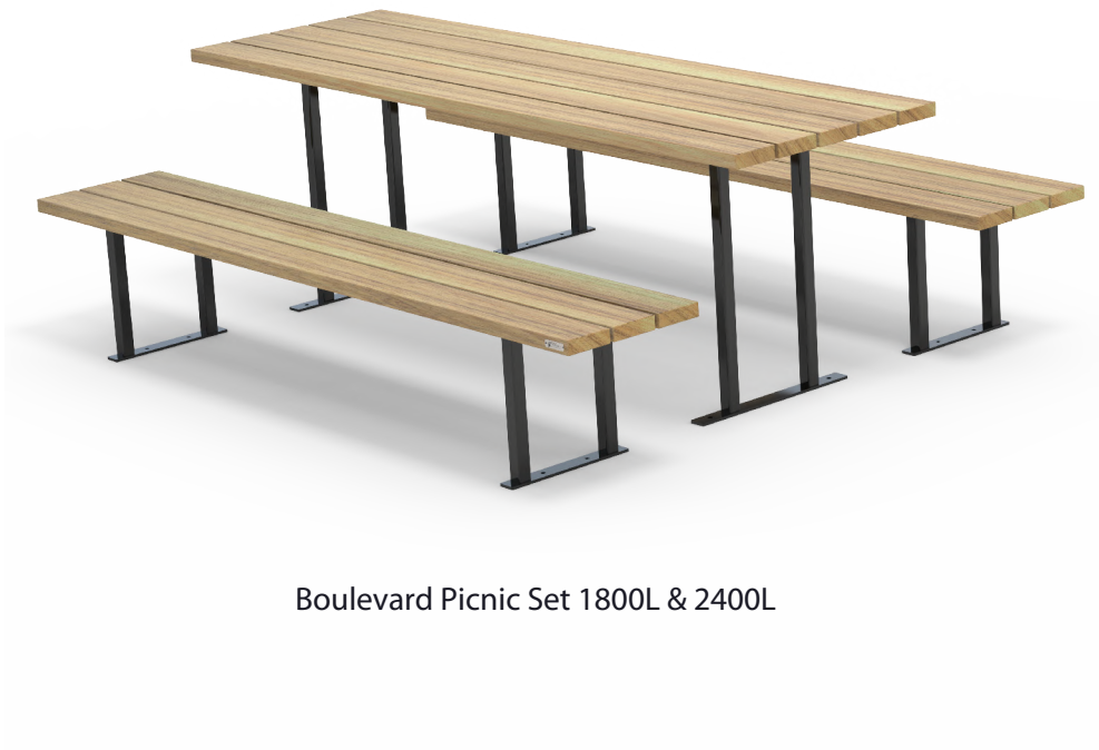
Boulevard Picnic Set 1800L & 2400L