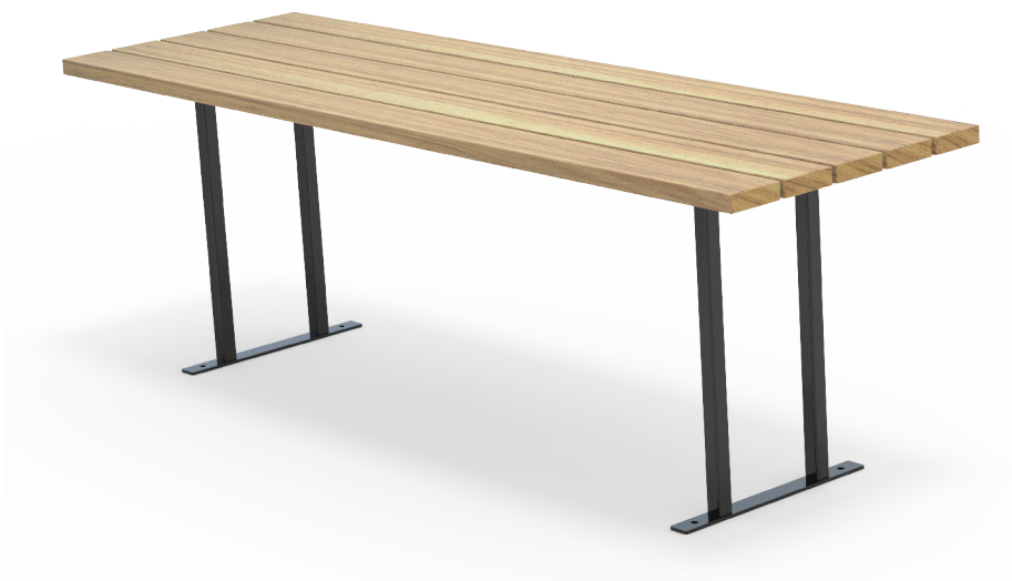
Boulevard Table 1800L & 2400L