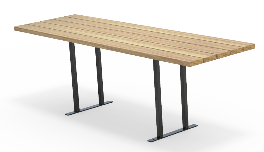
Boulevard Table AC 2400L