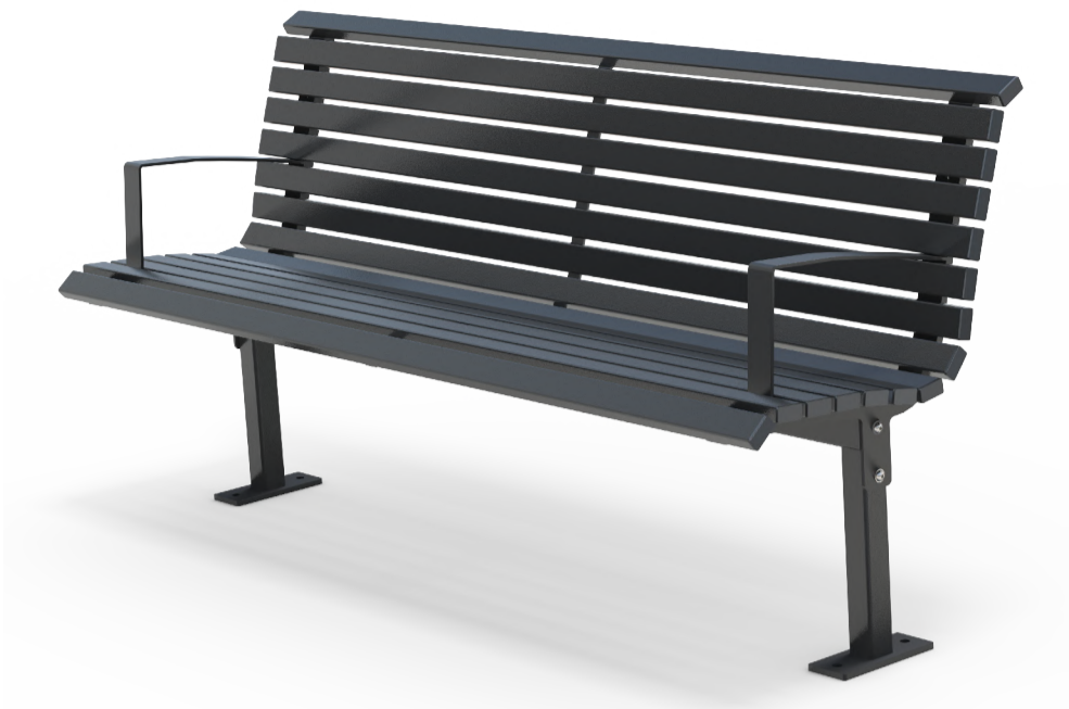
Brighton Seat Steel 1800L With Optional Armrests