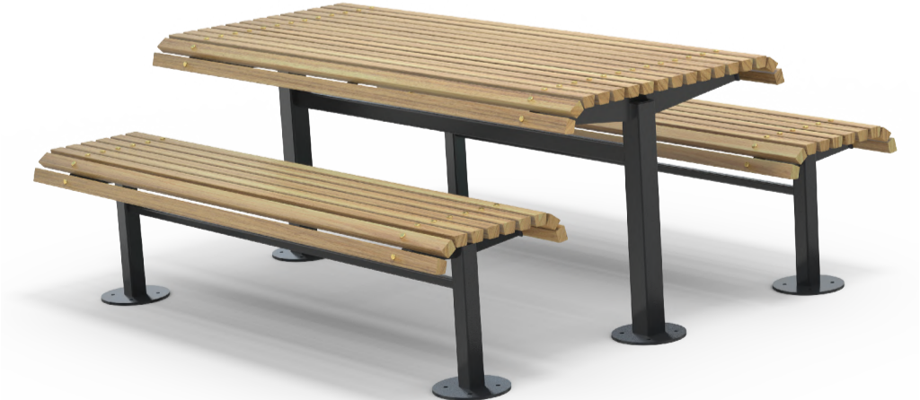
Brighton Picnic Set With Benches 1800L or 3000L