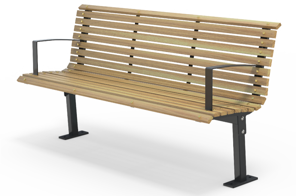
Brighton Seat 1800L With Optional Armrests