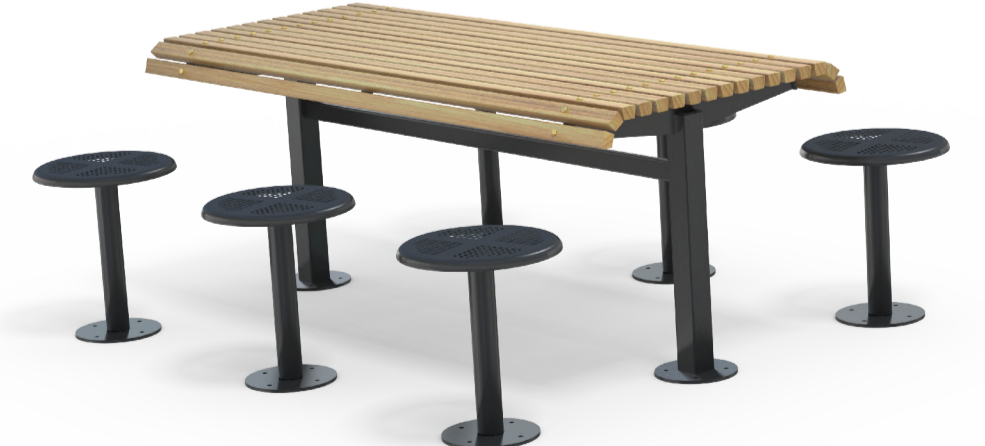
Brighton Picnic Set With Stools 1800L or 3000L