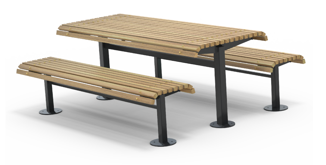
Brighton Picnic Set With Benches 1800L or 3000L