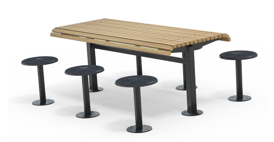
Brighton Picnic Set With Stools 1800L or 3000L