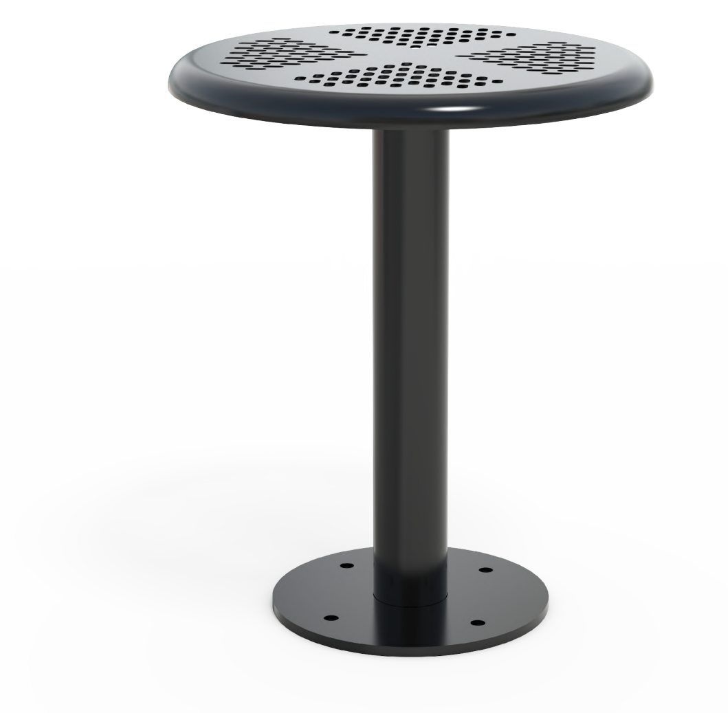
Colours / finishes shown are indicative only and may differ in reality.