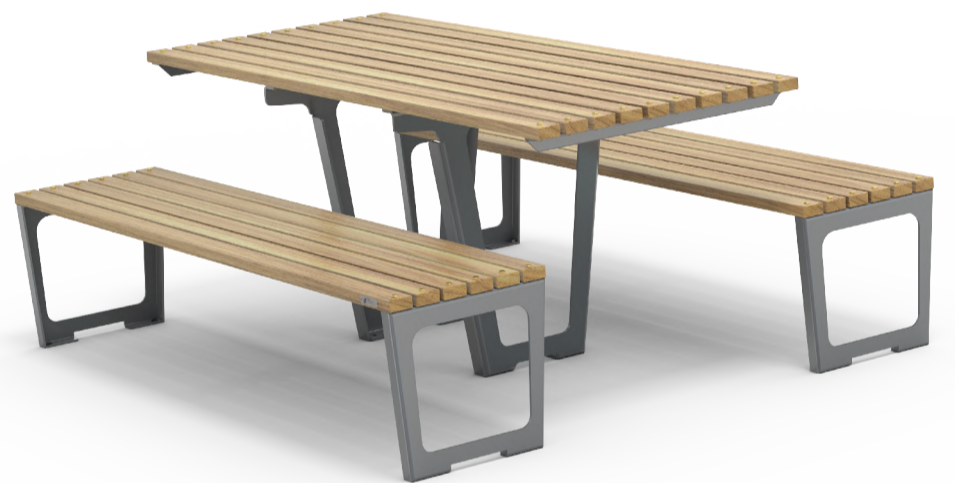
Civic Picnic Set AC 1800L