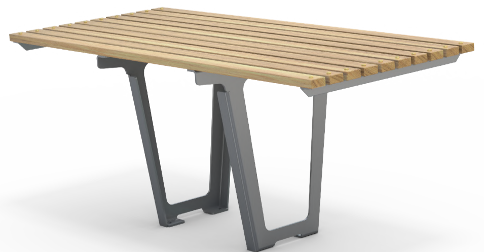
Civic Table AC 1800L