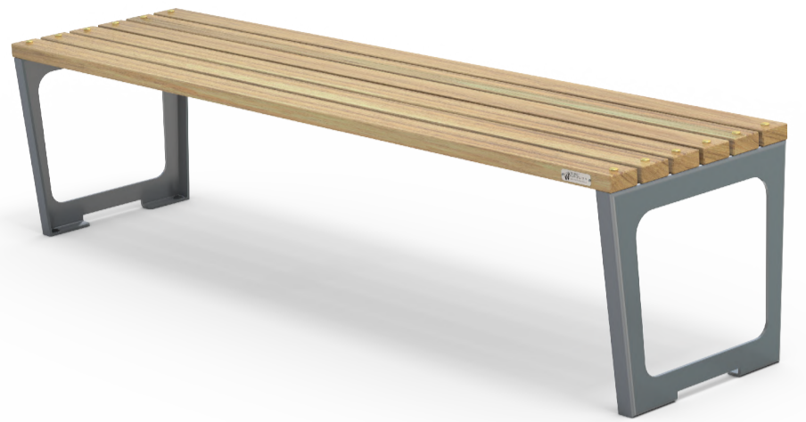
Civic Bench 1800L