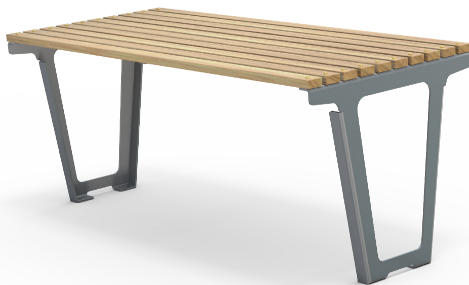
Civic Table 1800L