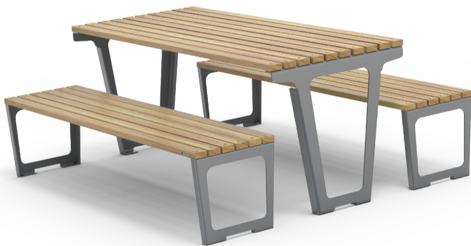
Civic Picnic Set 1800L