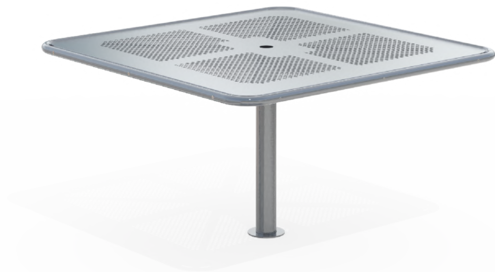
DM Steel Table 1200x1200