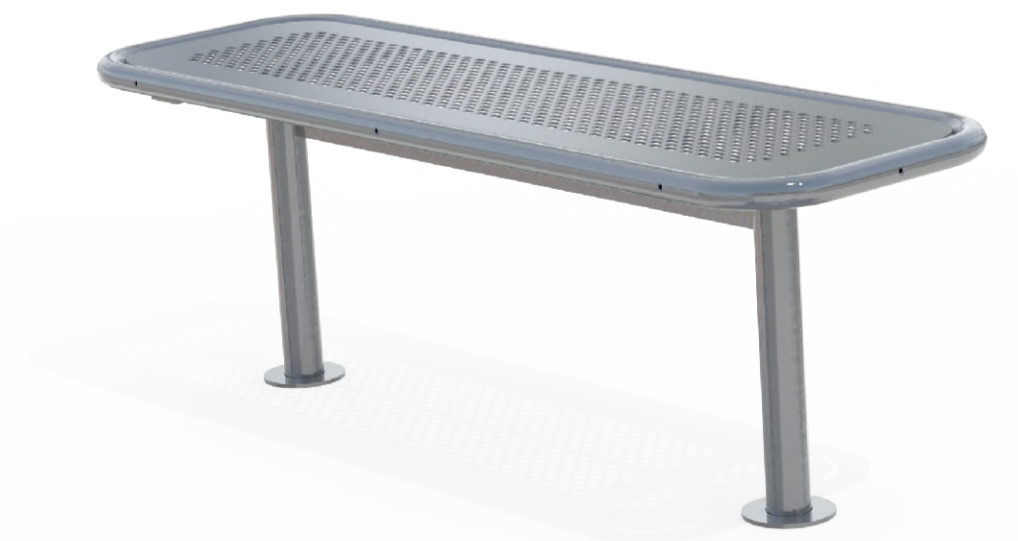
DM Steel Bench 1200L