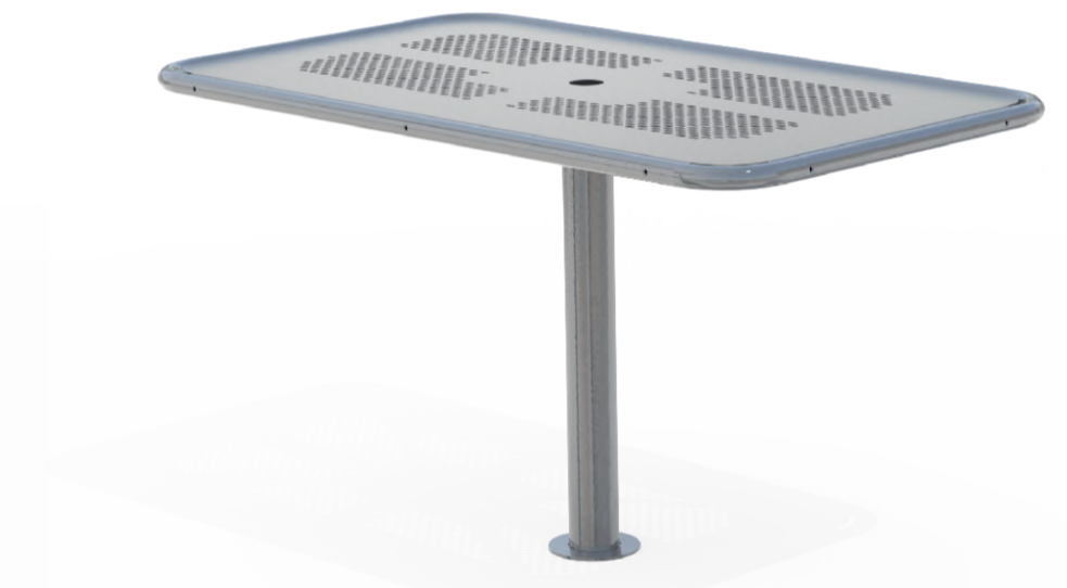
DM Steel Table 1200x700