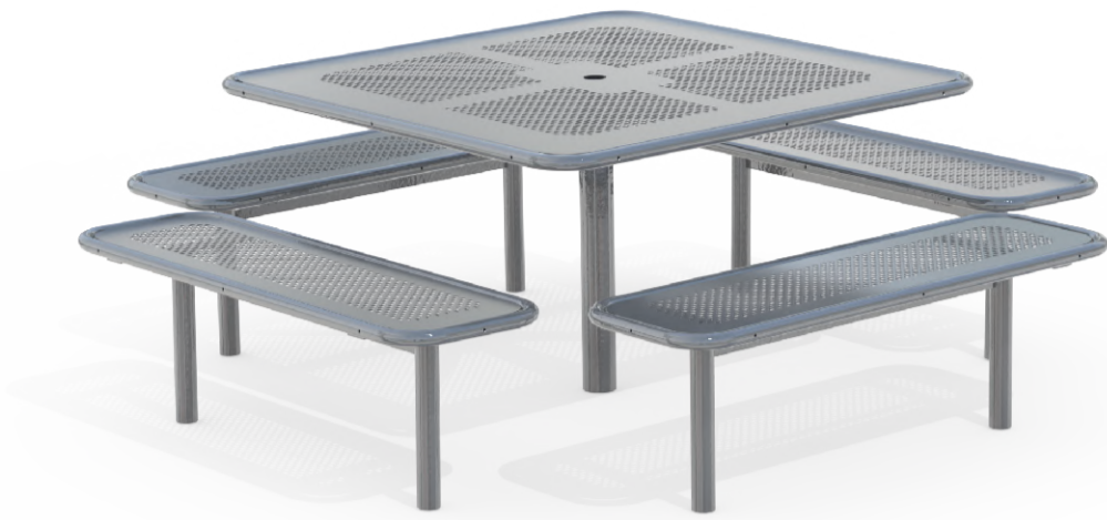
DM Steel Picnic Set 1200x1200