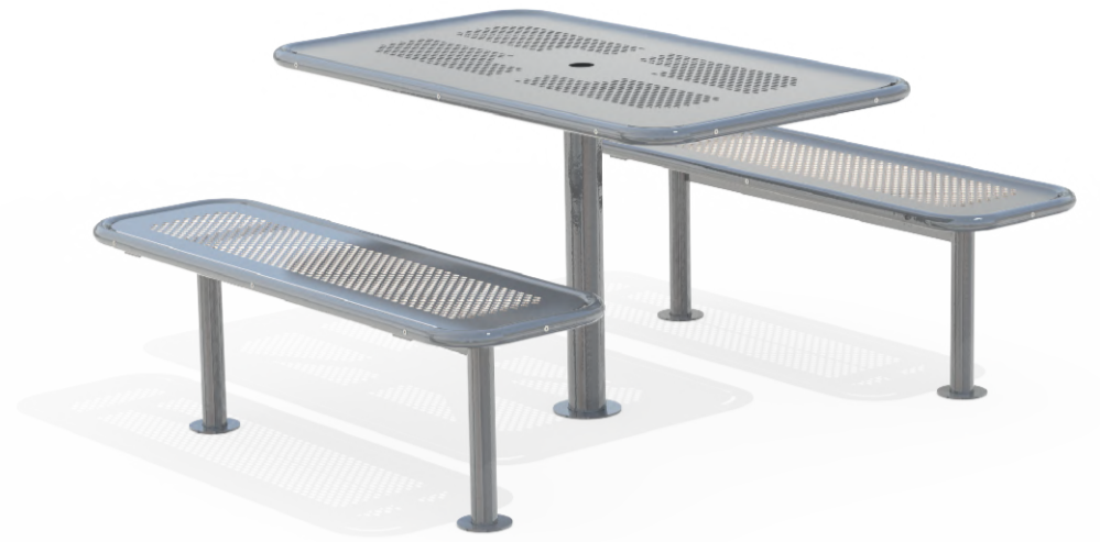
DM Steel Picnic Set 1200x700