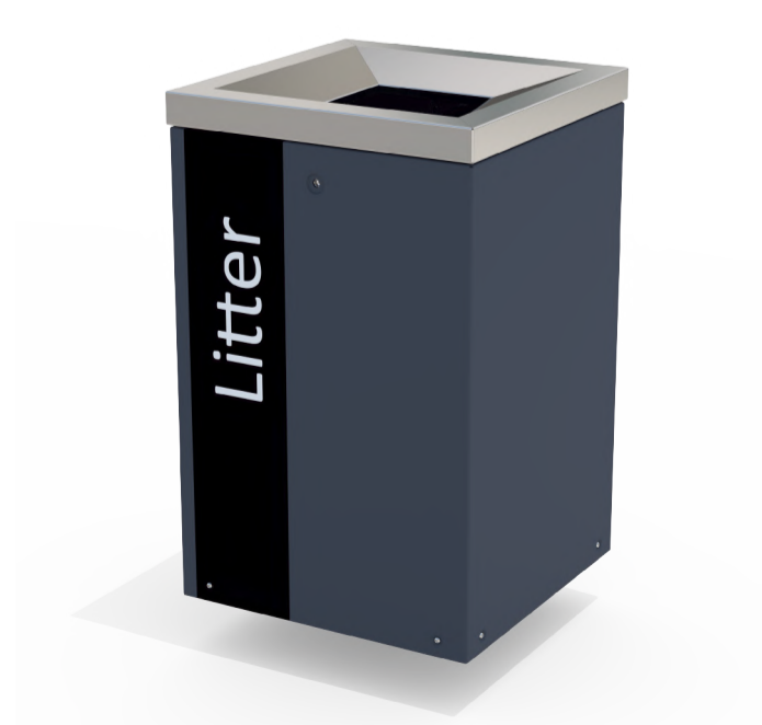
Mobilia Single Bin