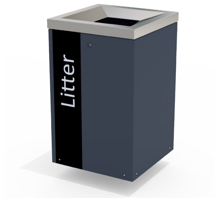
Mobilia Single Bin