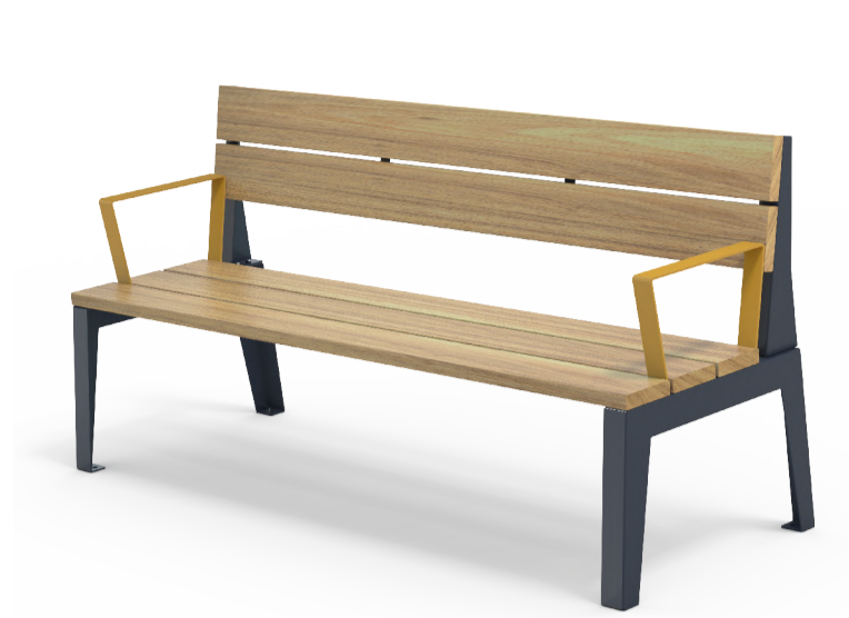
Mobilia Timber Seat 1800L With Optional Armrests