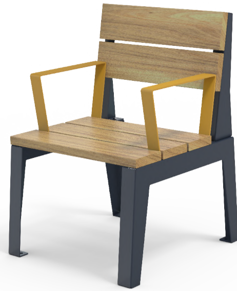
Mobilia Timber Chair 600L With Optional Armrests