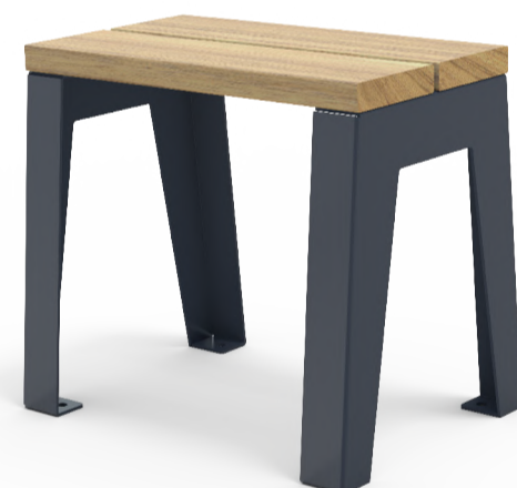
Mobilia Timber Stool 500L