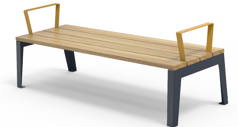
Mobilia Timber Bench 1800L With Optional Armrests