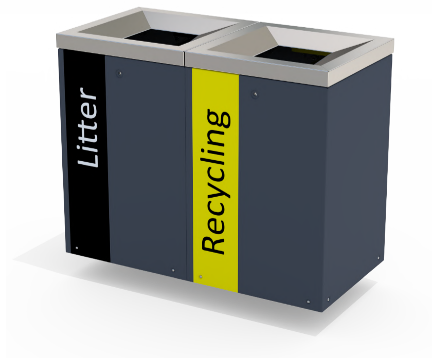
Mobilia Double Bin