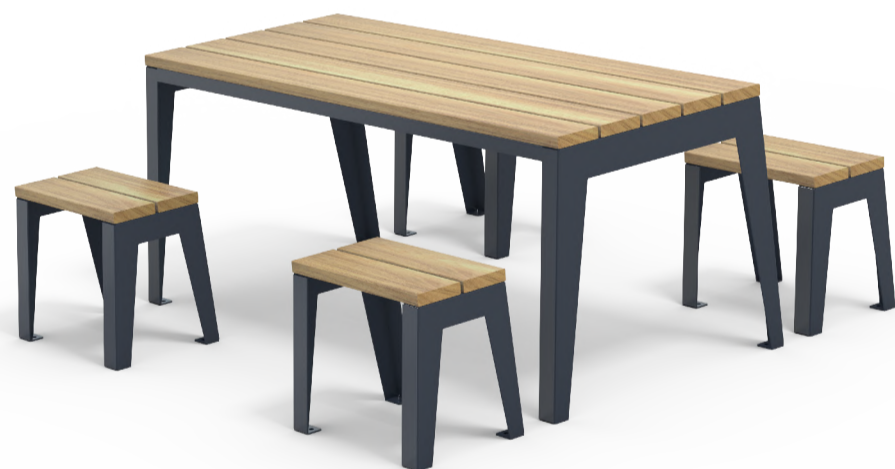
Mobilia Timber Picnic Set 1800L