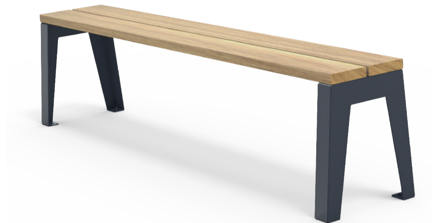
Mobilia Narrow Timber Bench 1800L