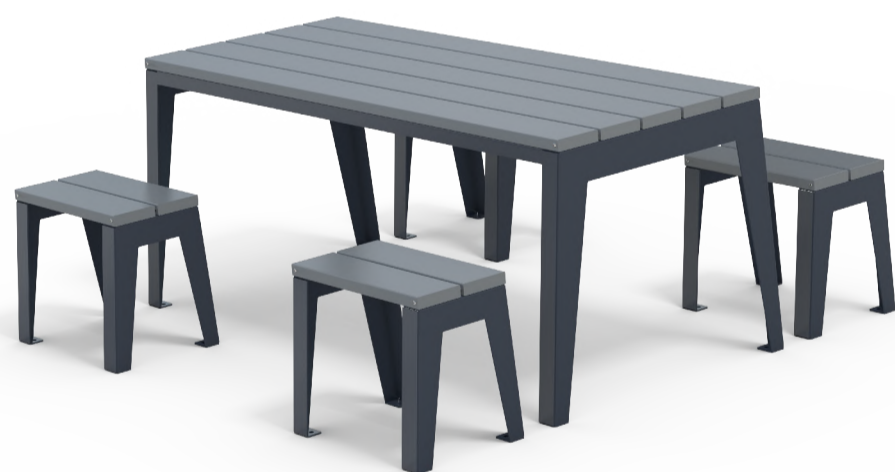
Mobilia Steel Picnic Set 1800L