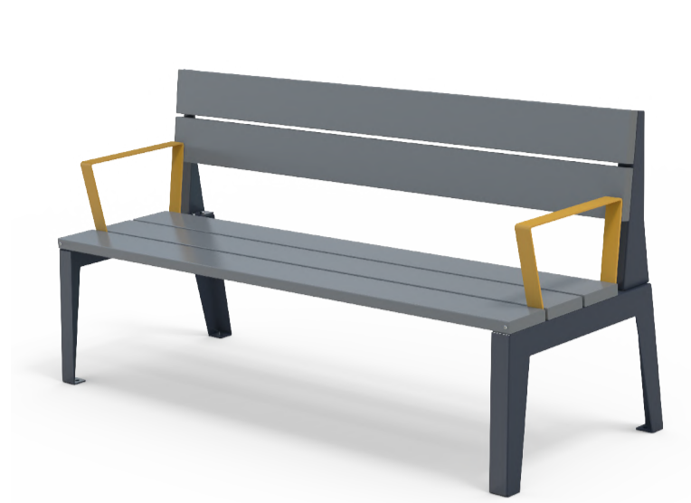
Mobilia Steel Seat 1800L With Optional Armrests