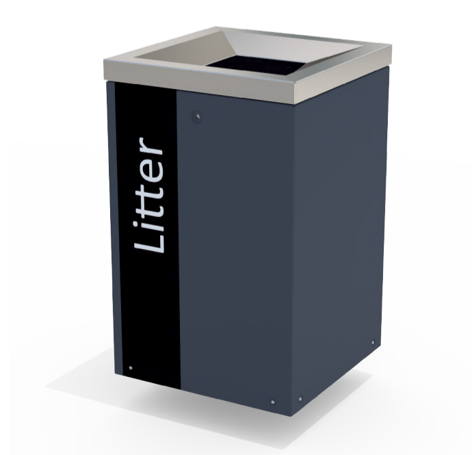
Mobilia Single Bin