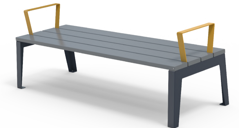
Mobilia Steel Bench 1800L With Optional Armrests