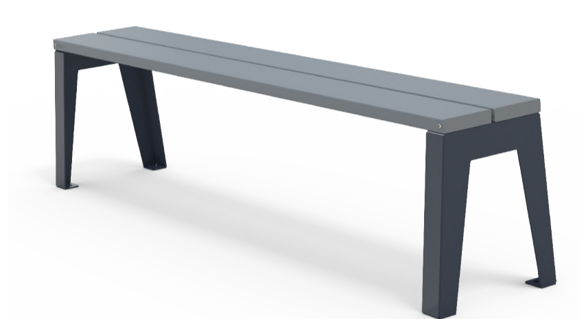
Mobilia Narrow Steel Bench 1800L