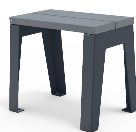
Mobilia Steel Stool 500L