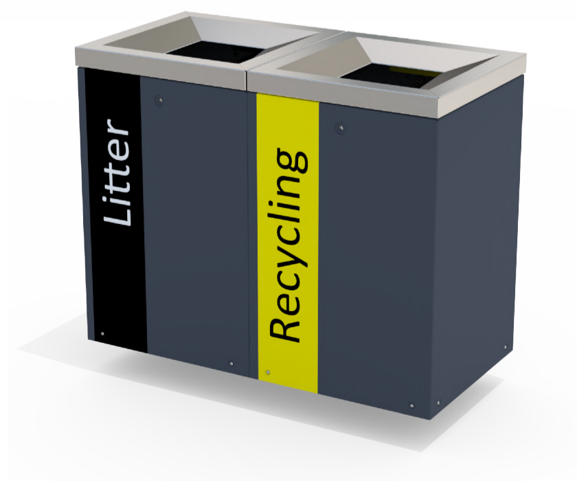
Mobilia Double Bin