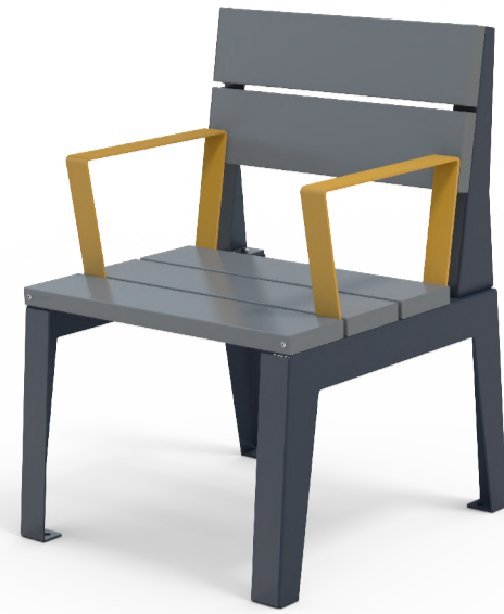
Mobilia Steel Chair 600L With Optional Armrests