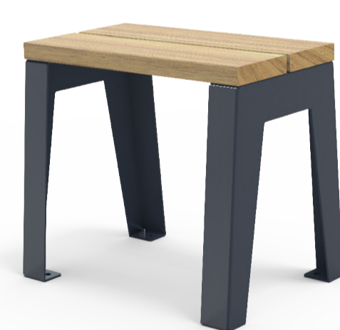
Mobilia Timber Stool 500L