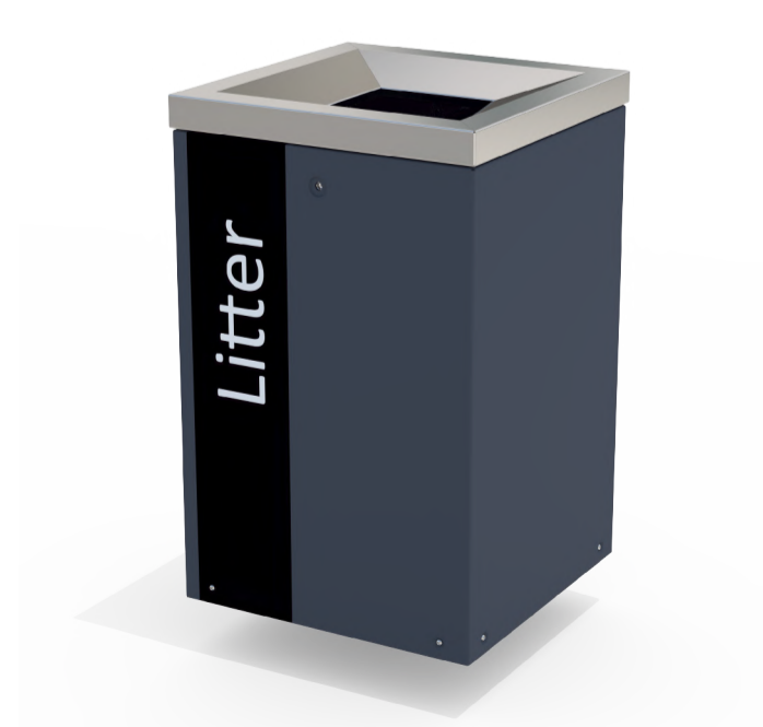
Mobilia Single Bin