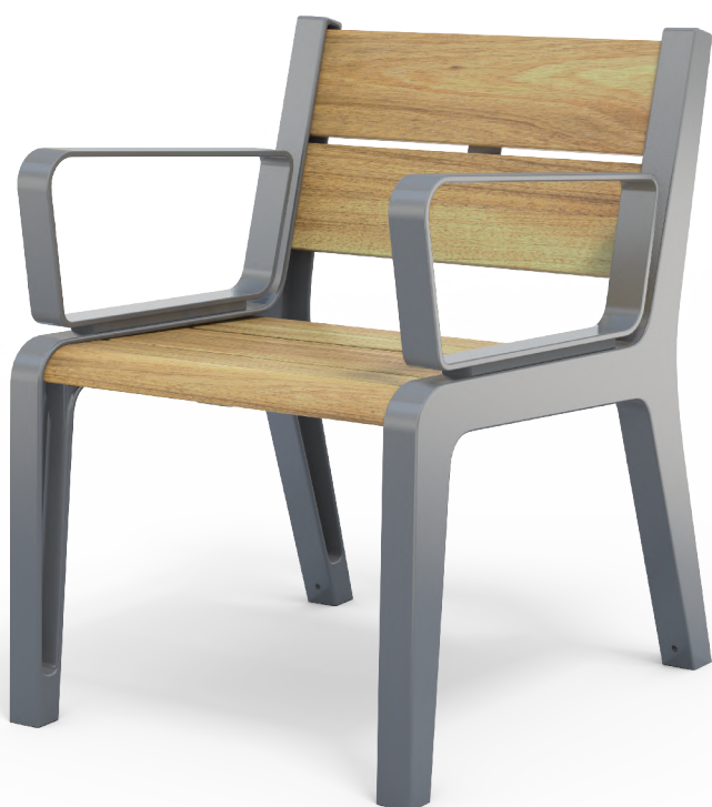
Ore Chair AC 600L