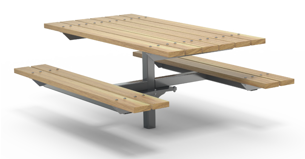
Portland Picnic Set AC Single Leg 1800L