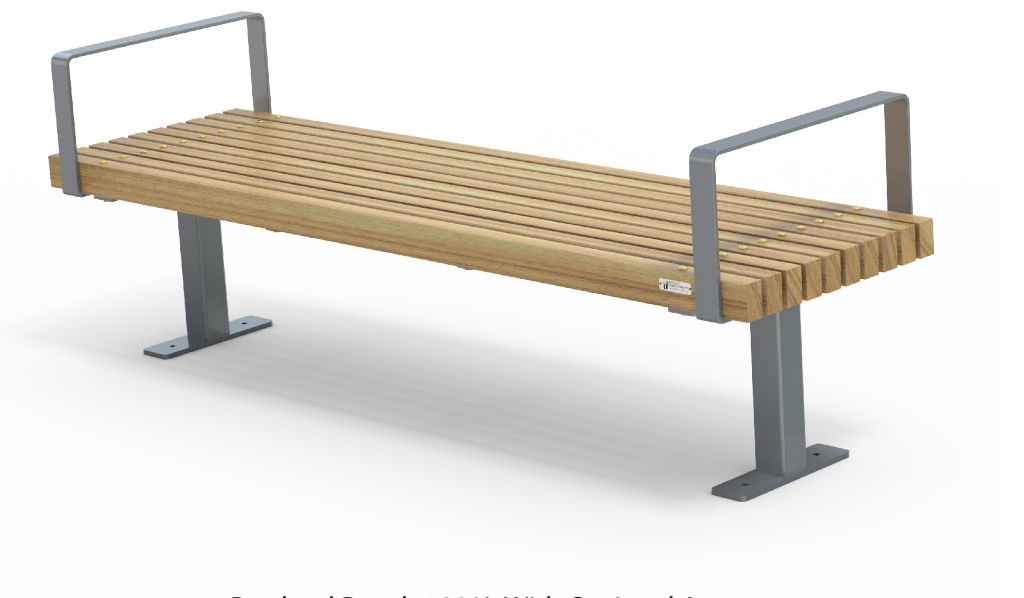
Portland Bench 1800L With Optional Armrests