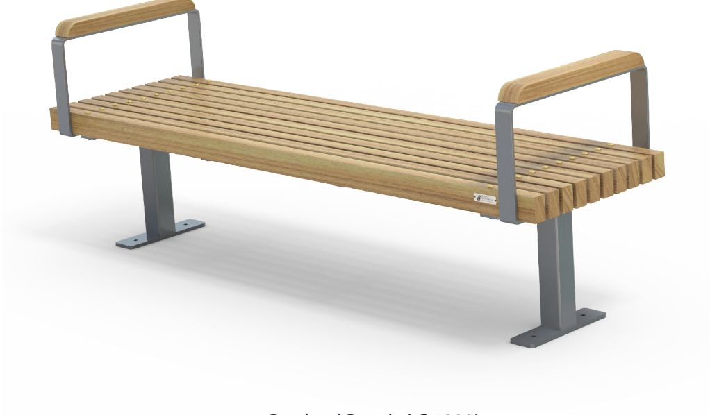
Portland Bench AC 1800L