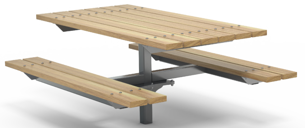
Portland Picnic Set AC Single Leg 1800L