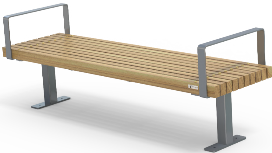
Portland Bench 1800L With Optional Armrests