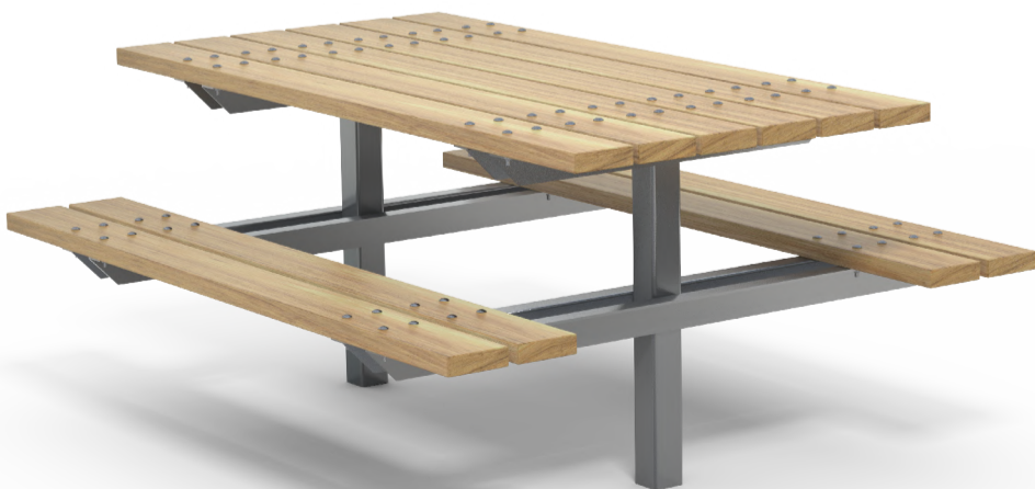
Portland Picnic Set 1800L