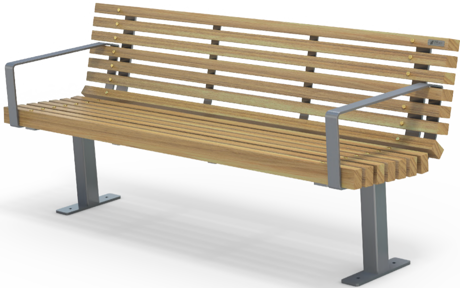
Portland Seat 1800L With Optional Armrests