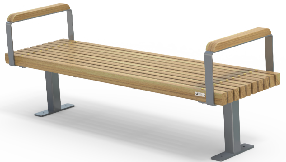
Portland Bench AC 1800L