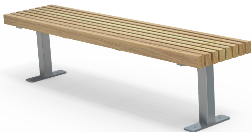
Sandringham Bench 1800L