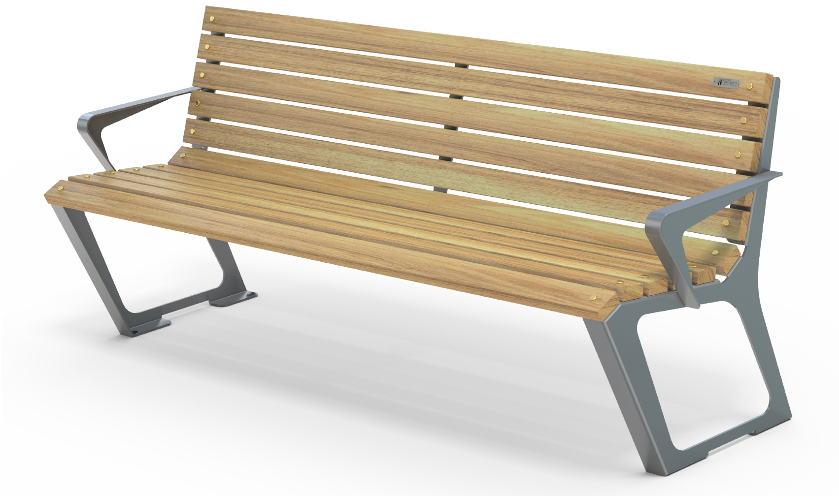
Colours / finishes shown are indicative only and may differ in reality. Seat shown with optional armrests.