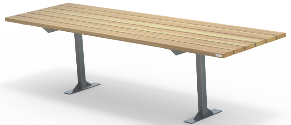
Esplanade Table AC 2100L or 3000L