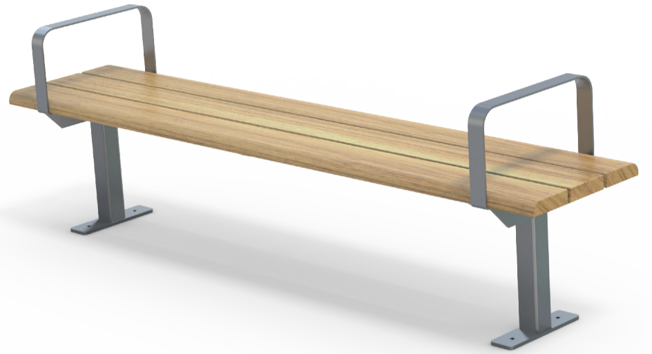
Esplanade Bench AC 2100L