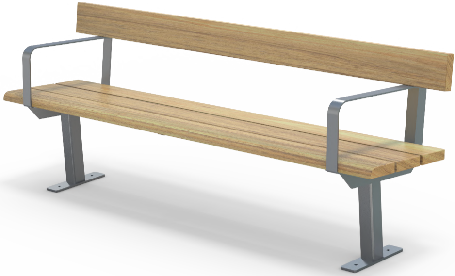
Esplanade Seat AC 2100L