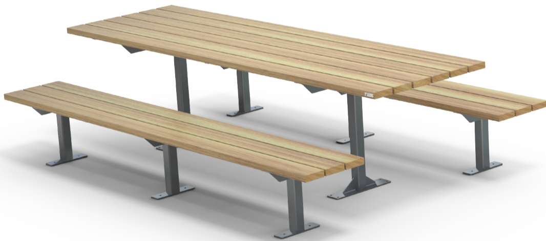
Esplanade Picnic Set AC 2100L or 3000L