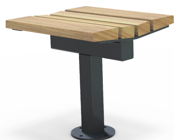
Marlborough Stool 450L