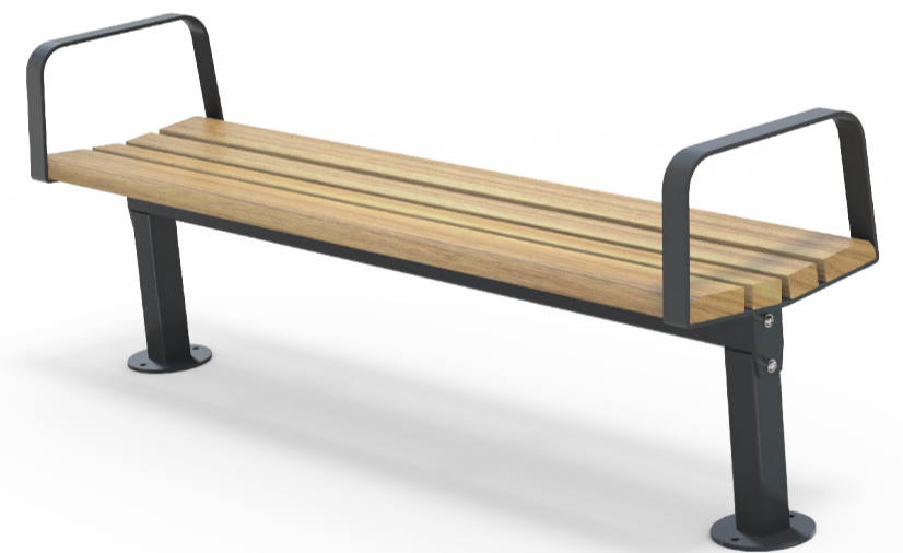
Marlborough Narrow Bench AC 1800L