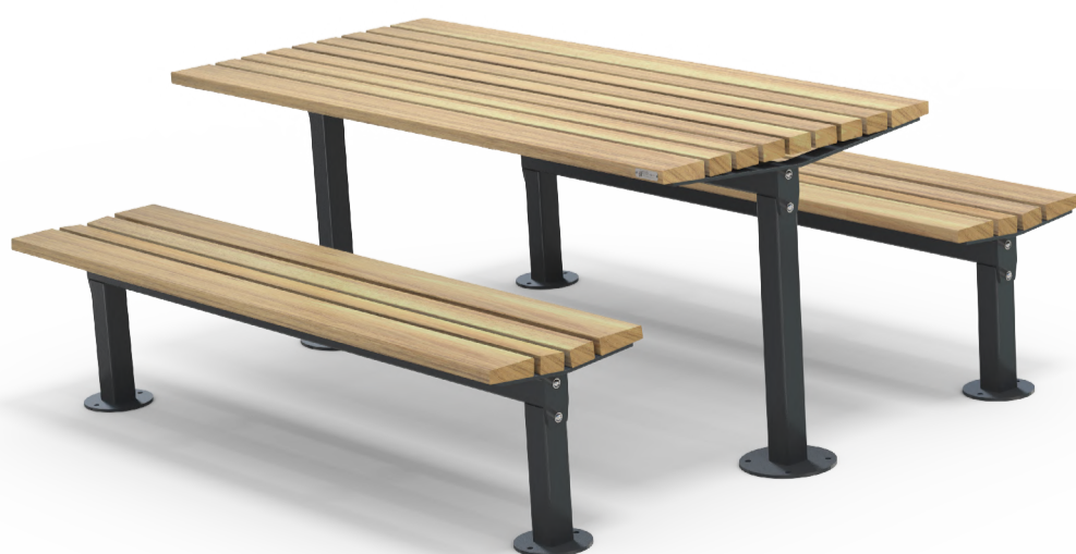
Marlborough Picnic Set 1800L