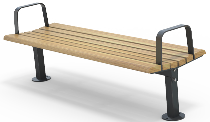
Marlborough Bench AC 1800L