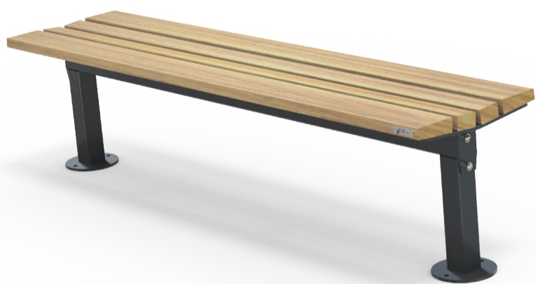
Marlborough Narrow Bench 1800L