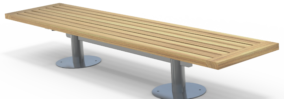
Nu Bench 2580mm Long