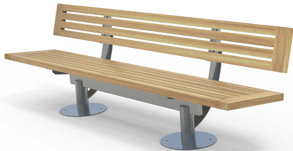
Nu Seat 2580mm Long with Timber Backrest