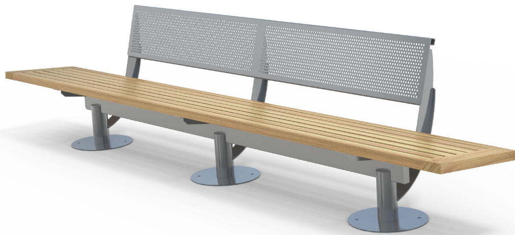
Nu Seat 3700mm Long with Perforated Steel Backrest