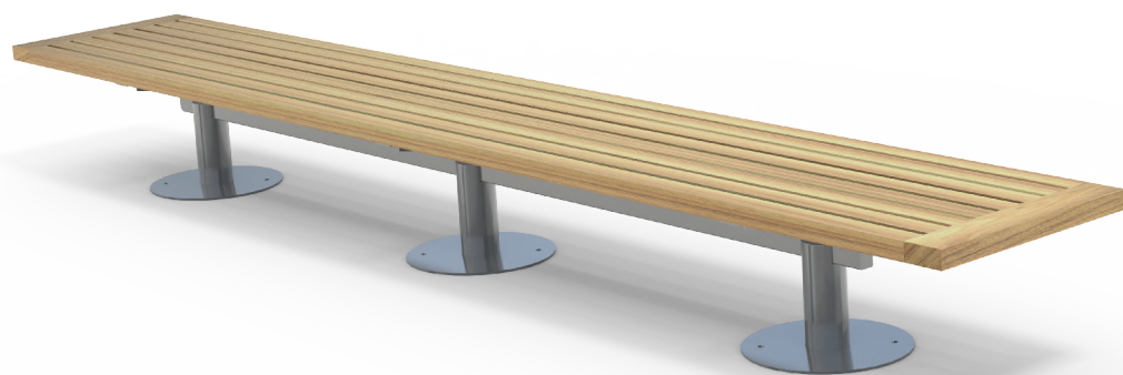
Nu Bench 3700mm Long