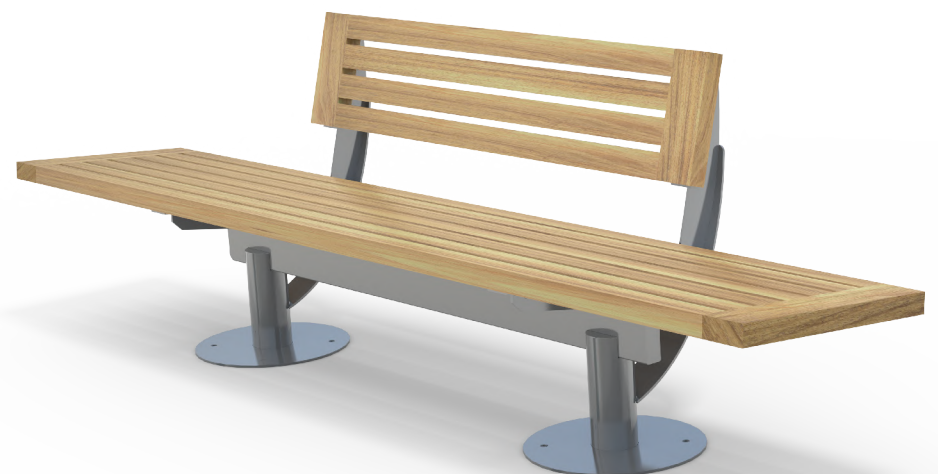
Nu Seat 2580mm Long with Timber Half Backrest