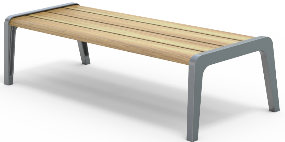
Ore Bench 1800L