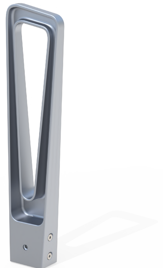
Ore Bollard & Cycle Stand