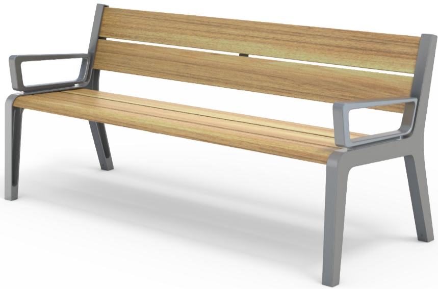
Ore Seat 1800L With Optional Armrests