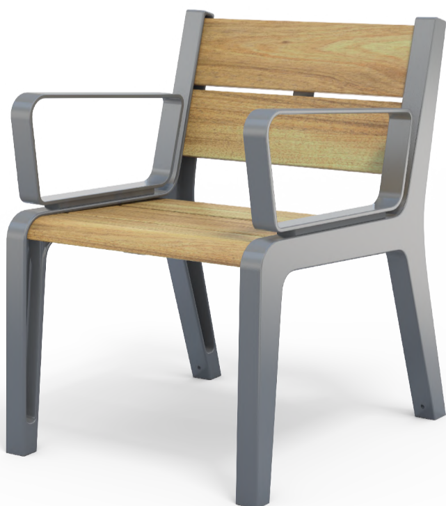
Ore Chair AC 600L