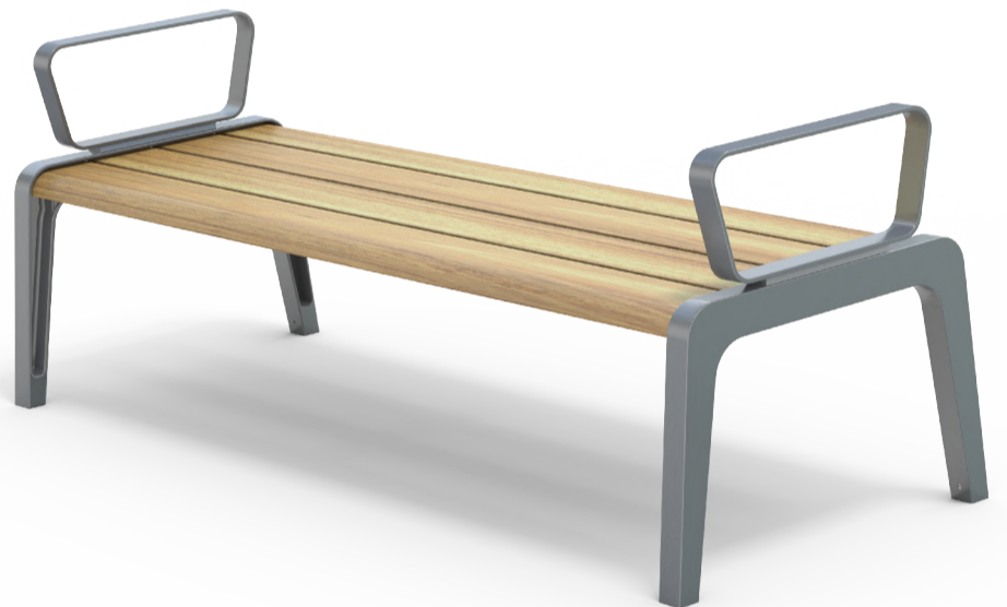
Ore Bench AC 1800L