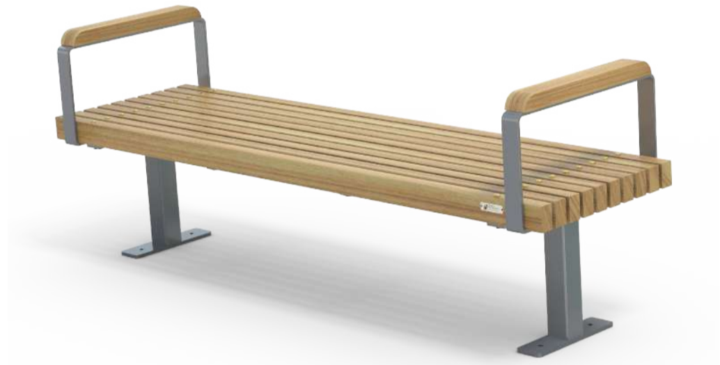
Ú[ !qə ə áÁÛ } ç@E{ €ŠÁ