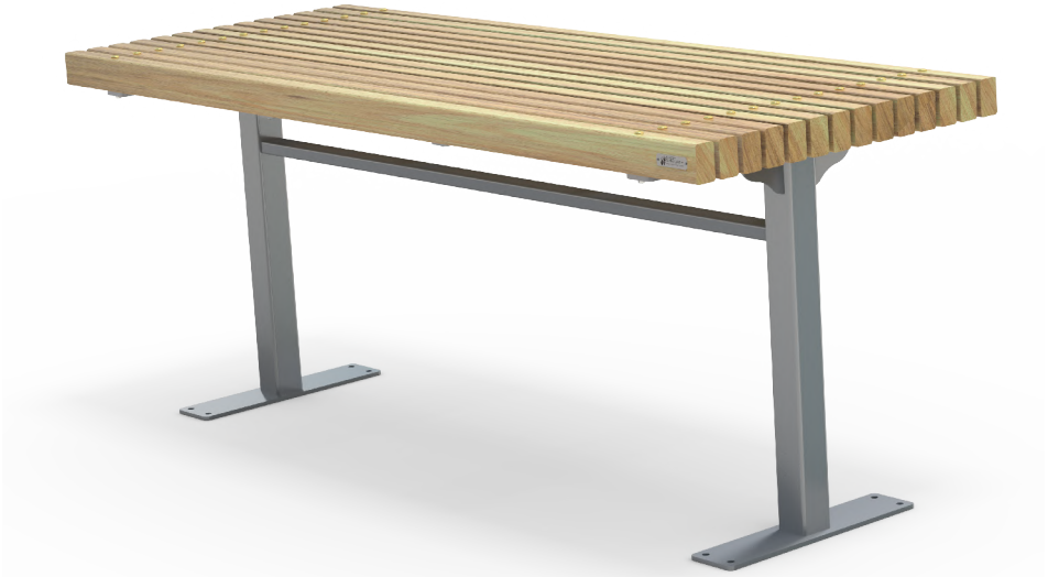
Sandringham Table 1800L