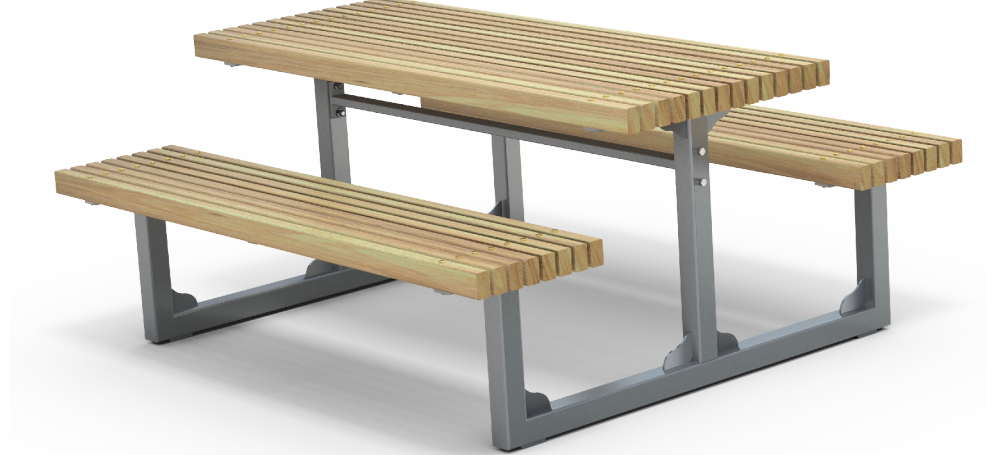
Sandringham Picnic Set Freestanding 1800L