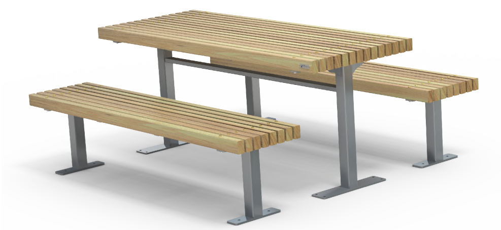
Sandringham Picnic Set 1800L