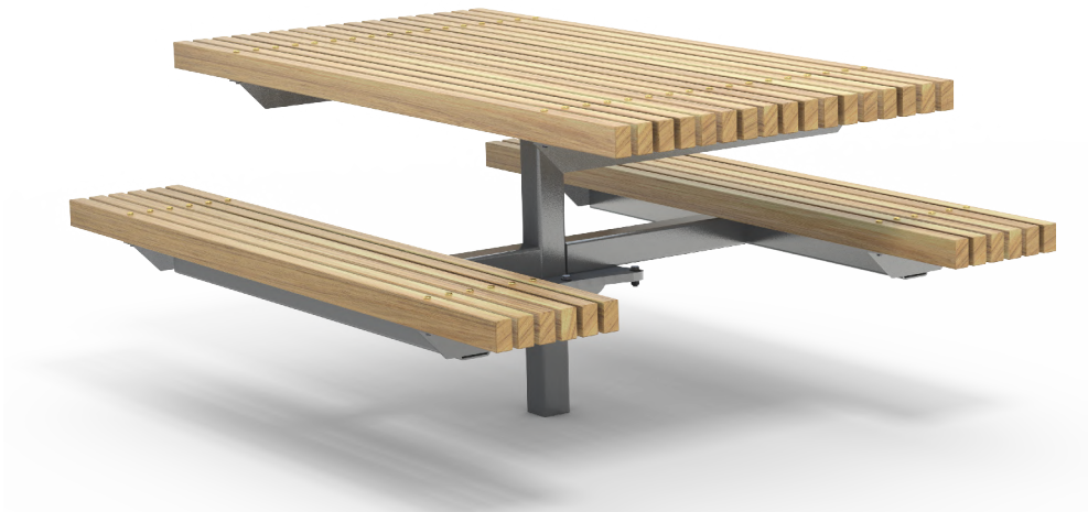
Sandringham Picnic Set AC Single leg 1800L