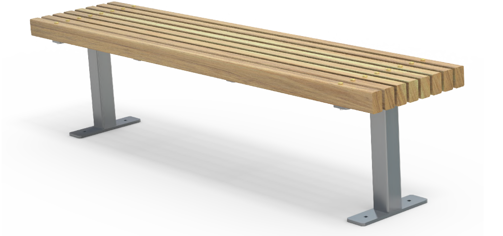
Sandringham Bench 1800L