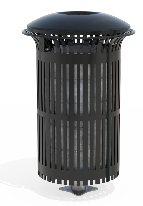
\grave{\mathsf{U}} \circ \!\!\!\! / \!\!\! \check{\mathsf{S}} [\;\check{\mathsf{a}}\; / \!\!\!\! \check{\mathsf{S}} [\;\; ] \; / \!\!\!\! \check{\mathsf{A}} \check{\mathsf{O}} [\; \{\; \wedge \hat{\mathsf{A}} \!\!\! \widehat{\mathsf{A}} \!\!\! \widehat{\mathsf{S}} \!\!\! \widehat{\mathsf{S}} \;\!\! ]