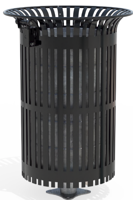
ÚoŠ[ ~ ã ÁJæ áæáÁ €ŠÁ