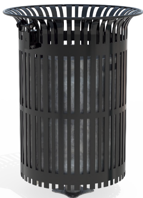
ÚoŠ[ ~ ã ÁJæ áæáÁ €ŠŠ