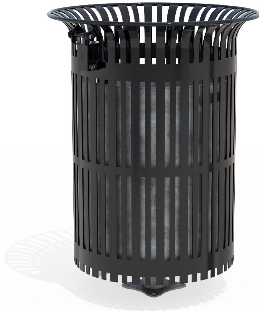
Účast v rámci FESÚC a a