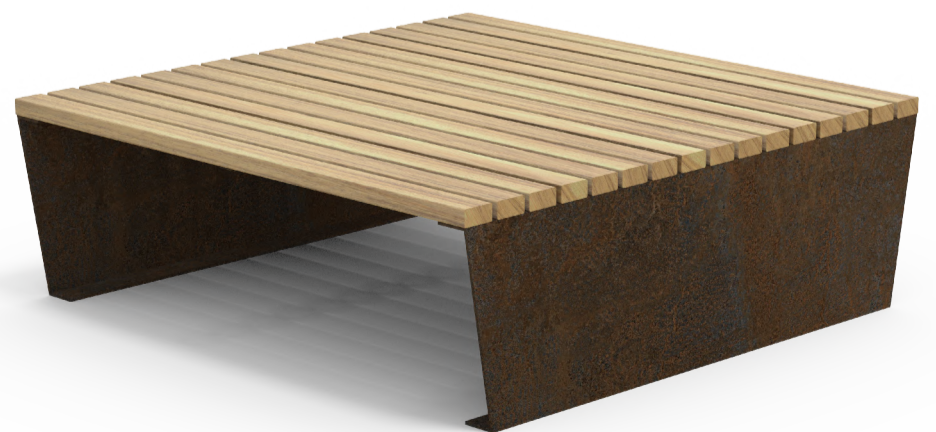
Te Mata Platform Bench 1200W X 1200L