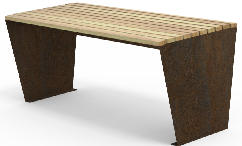
Te Mata Table 760W X 1800L