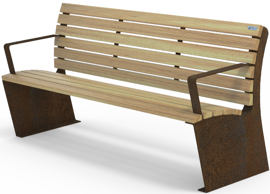
Te Mata Seat 1800mm With Optional Armrests