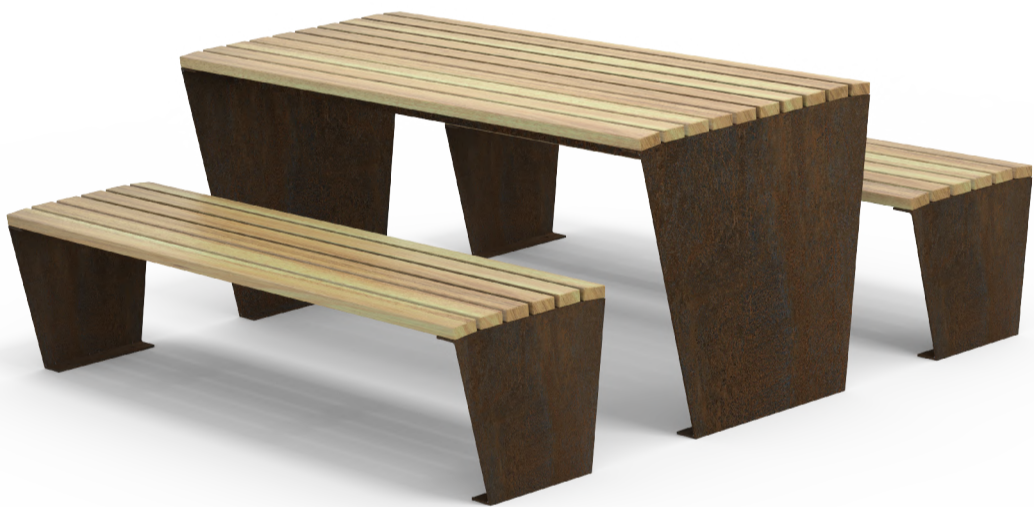
Te Mata Picnic Set 1800mm