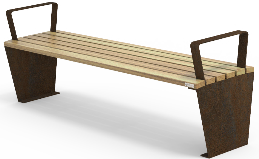
Te Mata Bench 1800mm With Optional Armrests