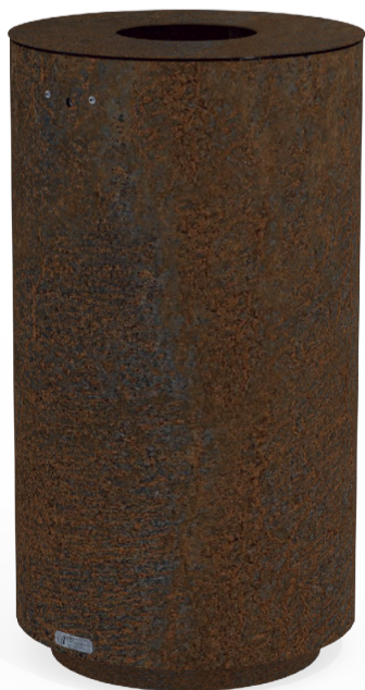
Te Mata Bin 60L