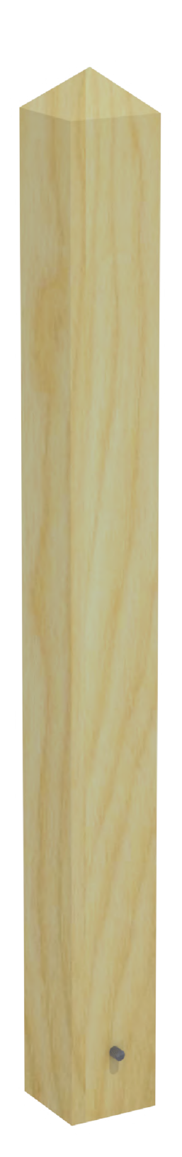
\hat{O}[\ \|[\ \lq\, \mid\bullet \ \text{Abd},\ \tilde{a}\ @\bullet \bullet \text{A}\ @]\ _{\}}\ \text{Abd}^{\wedge}\text{Ab},\ \tilde{a}\ \tilde{a}\ \text{Bosenso},\ \land (\tilde{h}\ _{)}\ |\ \land \text{Abd},\ \tilde{a}\ A'\ \text{ae}\ \hat{A}\ \tilde{a}\ \tilde{a}-\ \land (\tilde{h}\ \tilde{a}\ \tilde{a}\ \tilde{A})