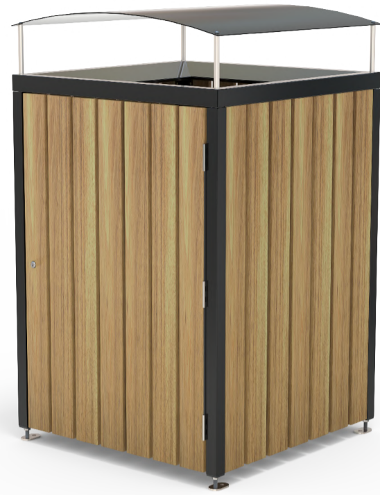
Queenstown 240L Single