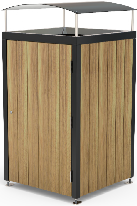
Queenstown 120L Single