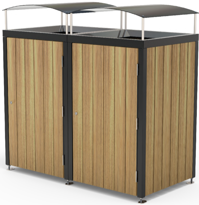
Queenstown 120L Double