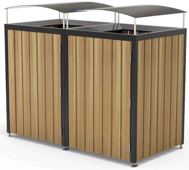
Queenstown 240L Double