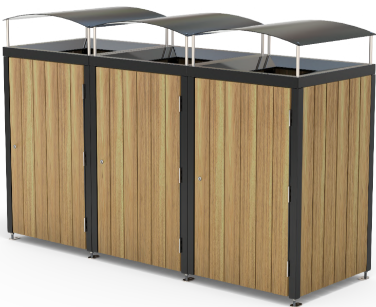
Queenstown 120L Triple