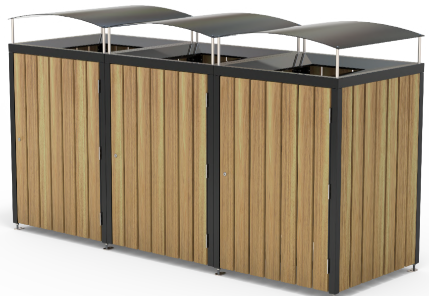
Queenstown 240L Triple