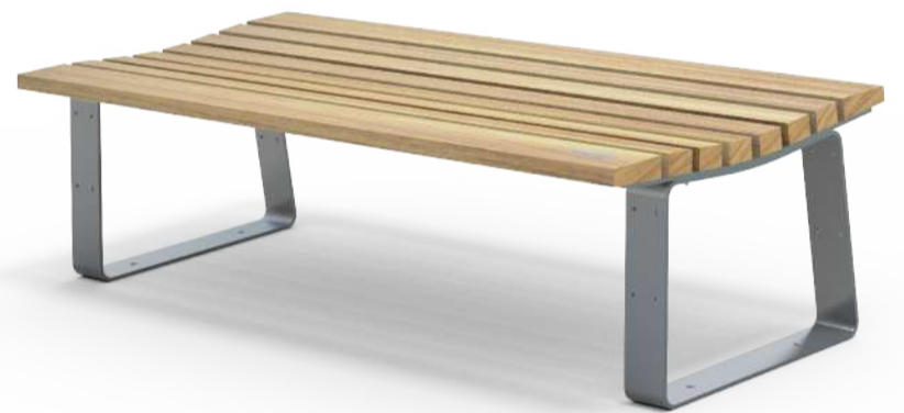
Óäæ^!æÛ^ çí €Š