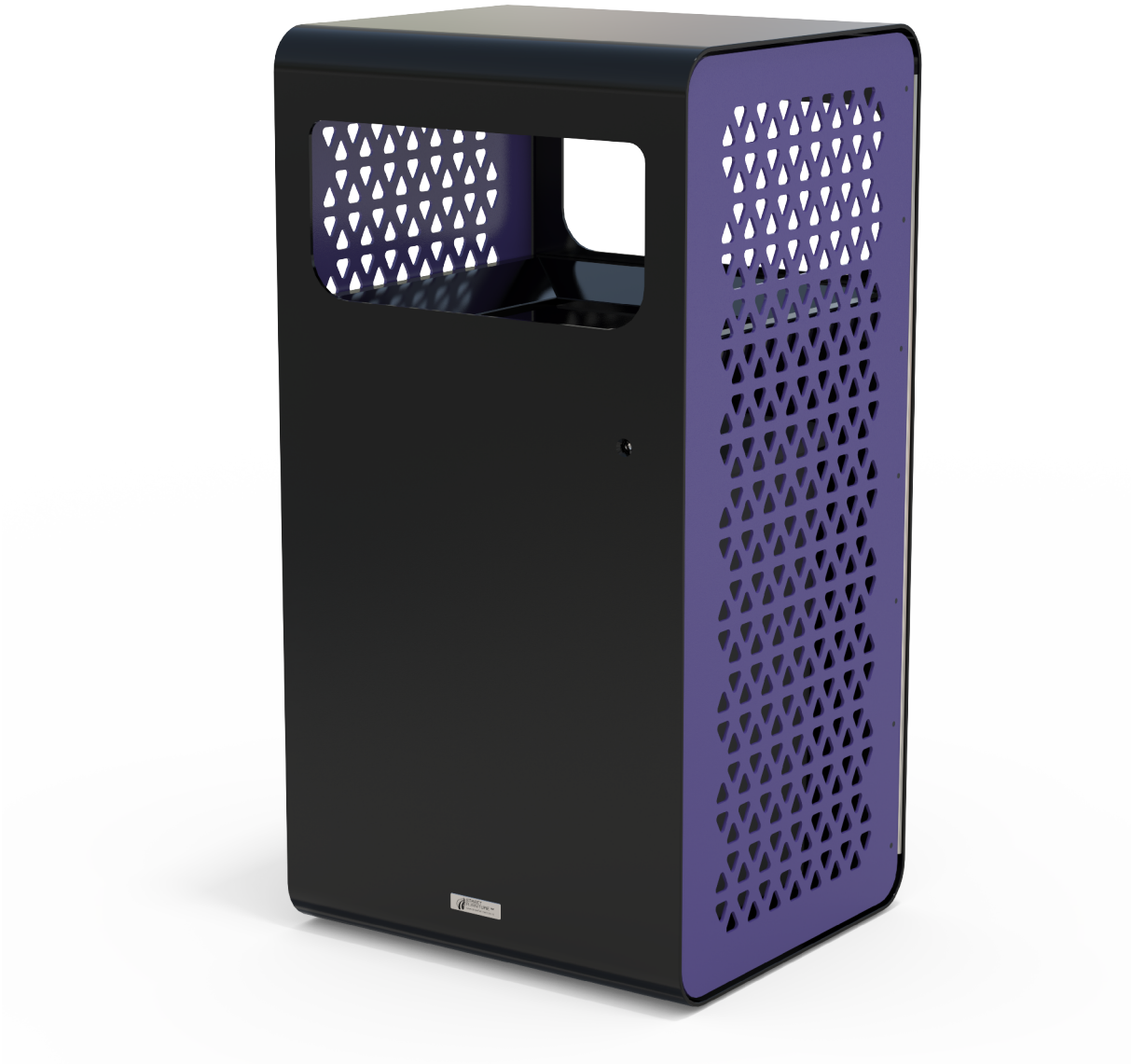
Colours / finishes shown are indicative only and may differ in reality.