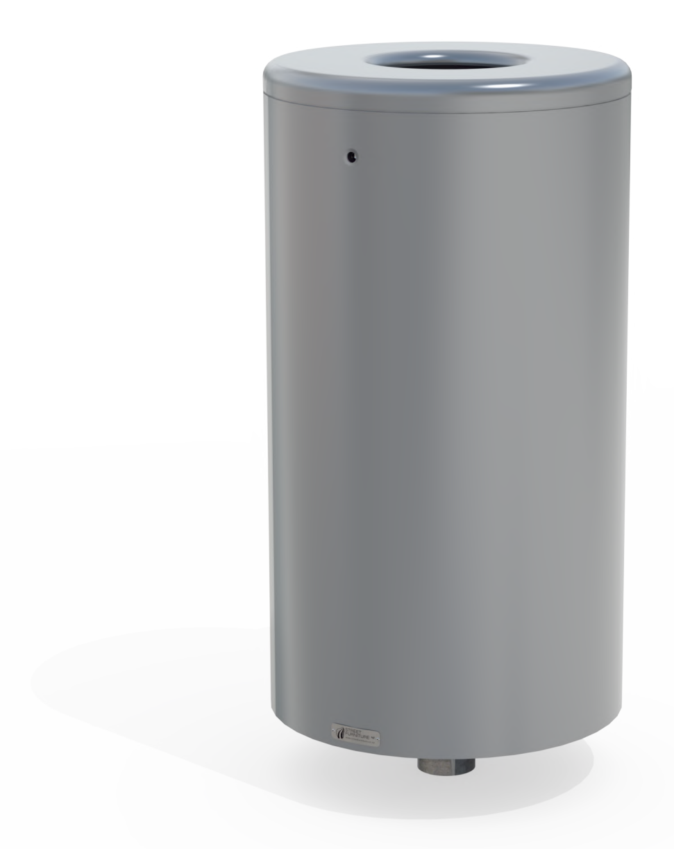
\hat{O}[\ |[\ ``\ | \bullet \ \acute{A}D\mathring{A}]\ \tilde{a}\ @\bullet \bullet \acute{A}\ @]\ _{2}\ \acute{A}d^{2}\wedge \mathring{A}]\ \mathring{a}\ \tilde{a}Bace \tilde{a}_{0}^{*}\wedge \acute{A}[\ _{1}\ _{2}\ ]\ \mathring{A}d^{2})\ \mathring{a}\ \acute{A}(\ \ \varpi\hat{a}\ \acute{A}^{*})\ \mathring{a}\ \mathring{A}^{*})