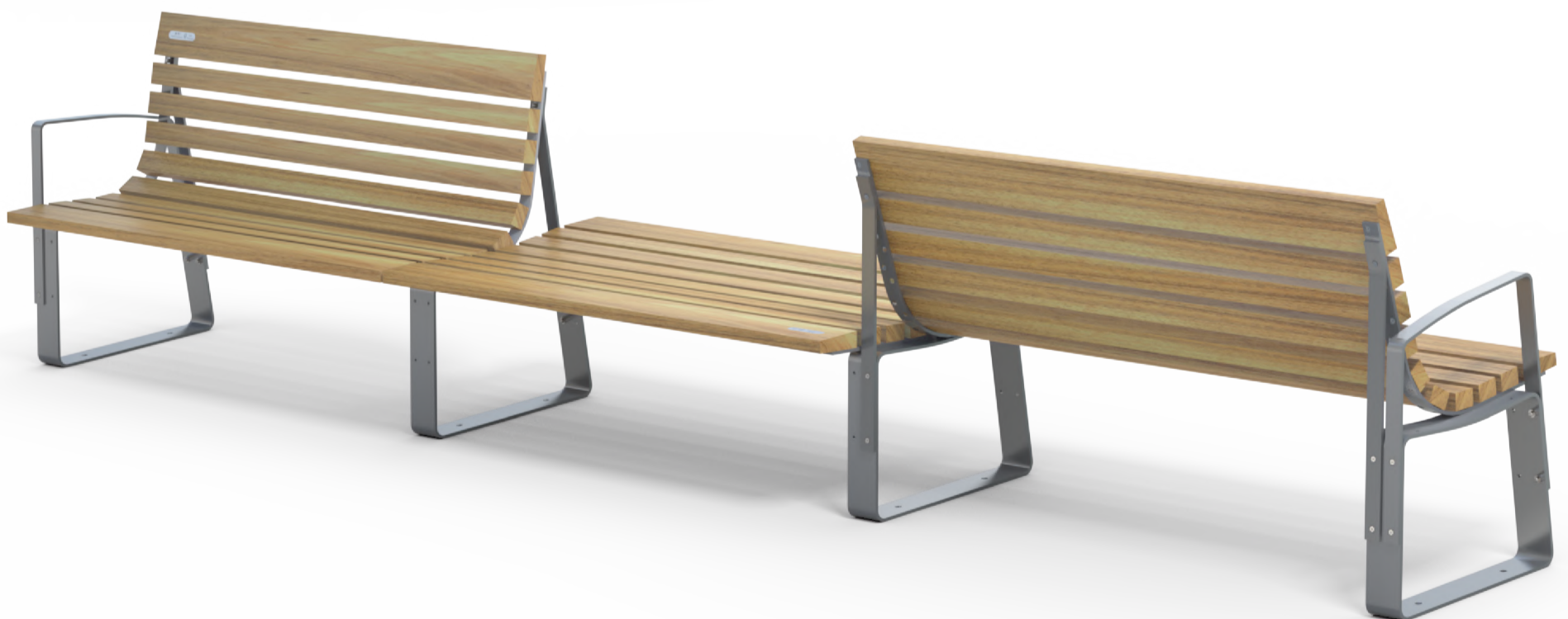
Óäæ^!æÛ^ æí €Š