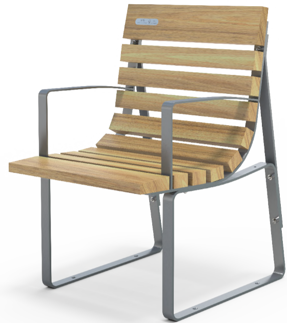
Óäæ^!æÛ^ çí €Š