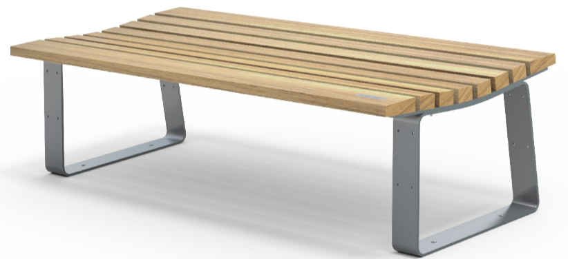
Óäæ^!æÛ^ çí €Š