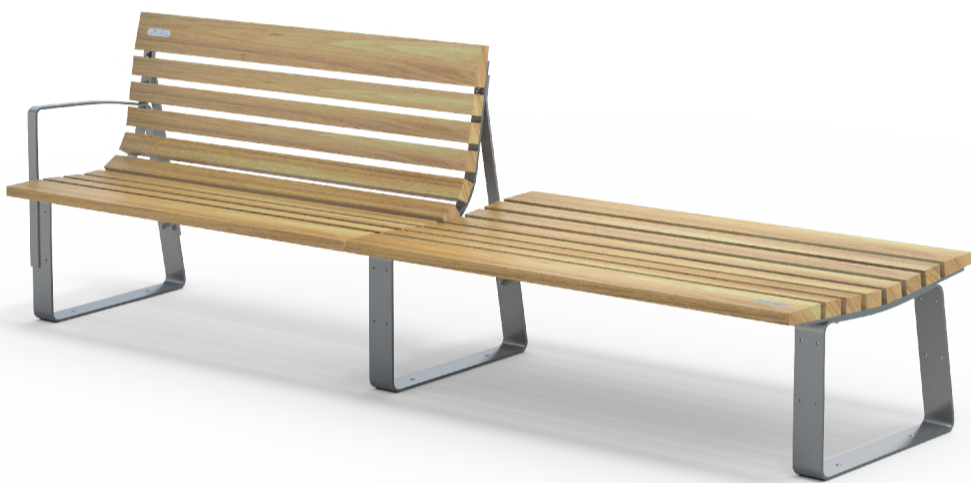
Óäæ^!æÛ^ æí €Š