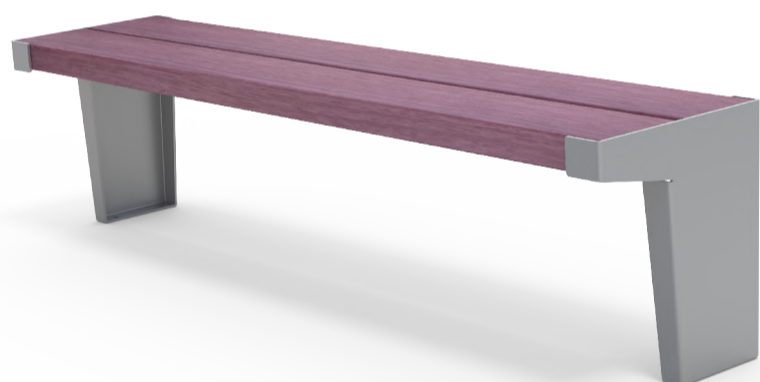
Bastion Narrow Bench 1800L