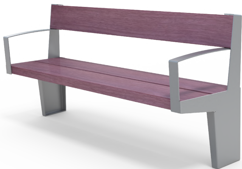
Bastion Seat 1800L with Optional Armrests