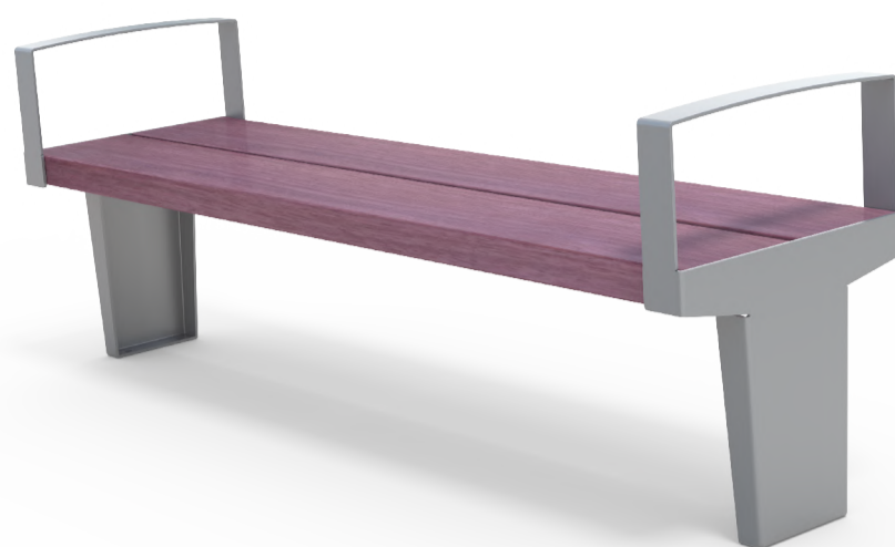
Bastion Bench 1800L with Optional Armrests