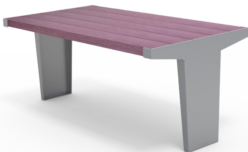
Bastion Table 1800L