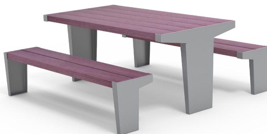
Bastion Picnic Set 1800L