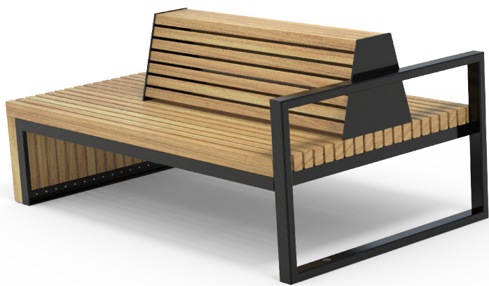
Ôæ ãæÁÛ æ^ à ^ ÁÛ æ^ ÆŠÁ