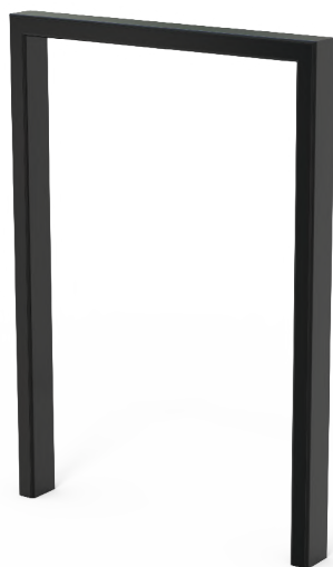
Ôæ ãæÁÛ æ^ & ^ ÁÛ æ^ á