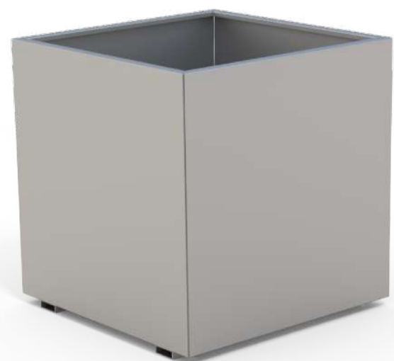
h " " " 0 h " " " " " "