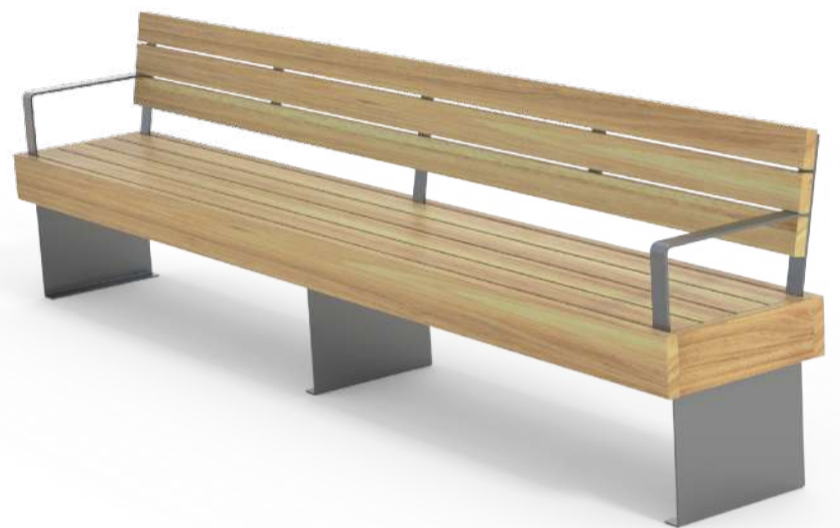
h " " 0