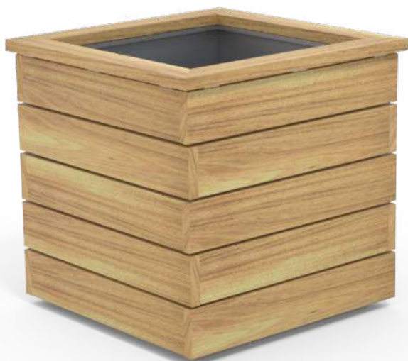
h " " h " " " " " "