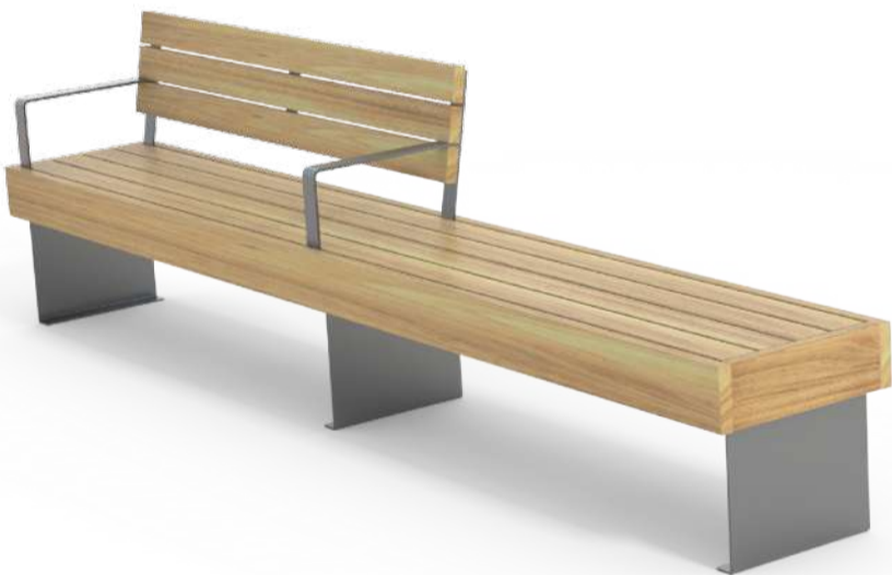
h " " " " 0