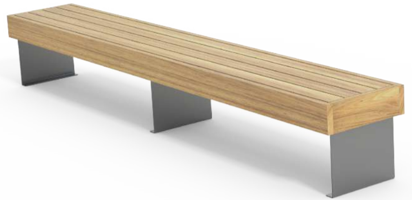
h " " 0