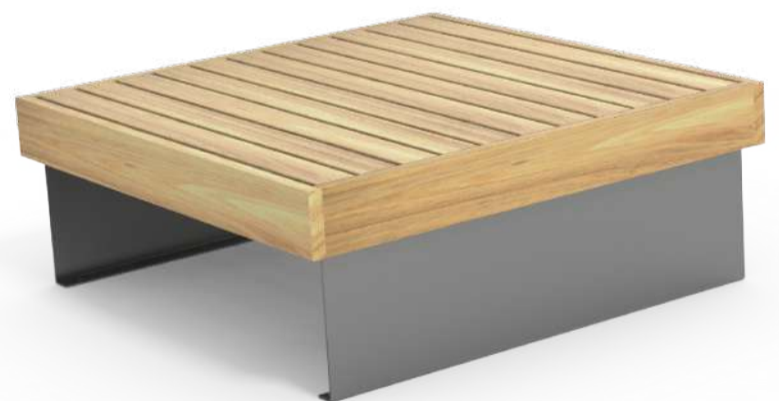
h h " " " " " "