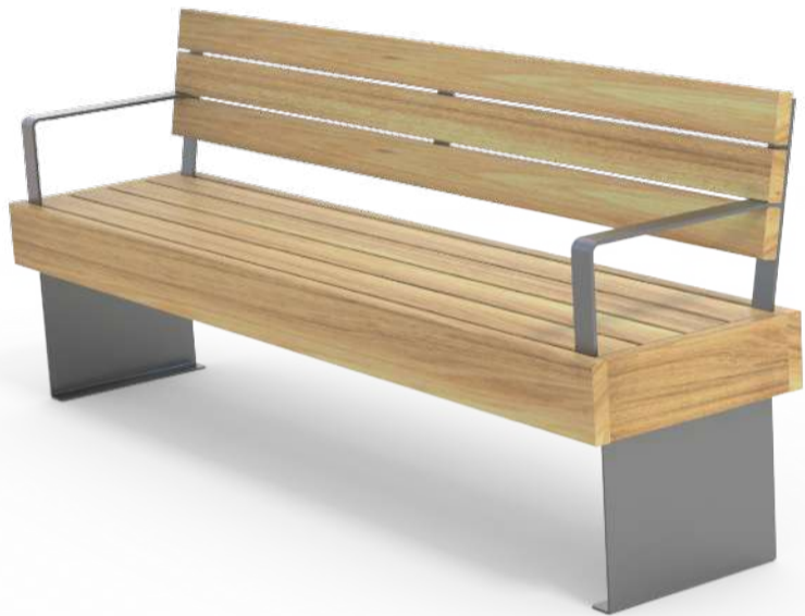
h " " 0