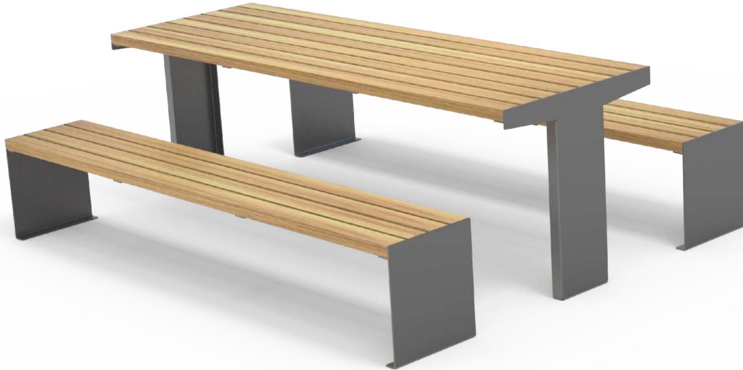
Technical drawing of the bench and table set.