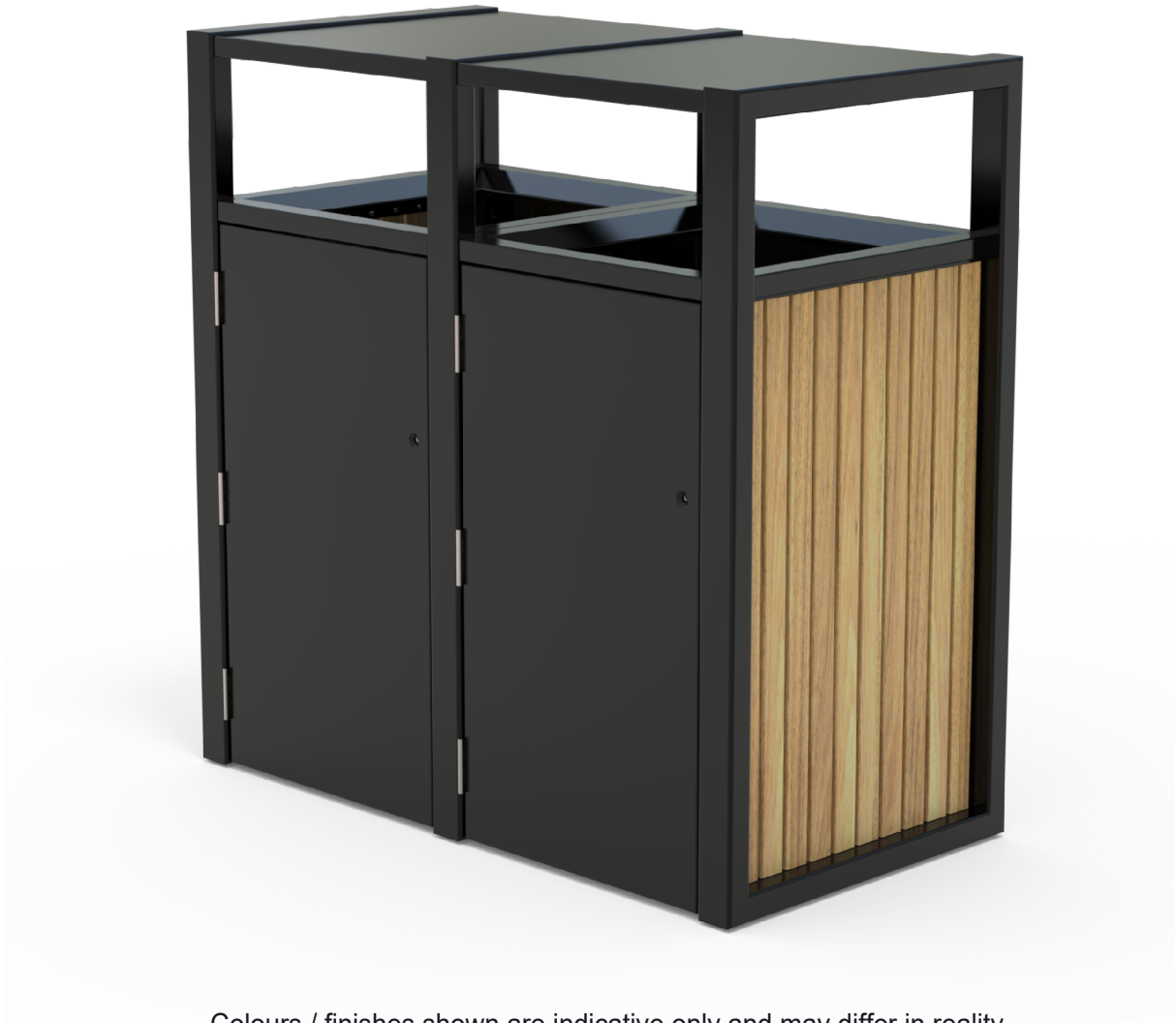
Colours / finishes shown are indicative only and may differ in reality.