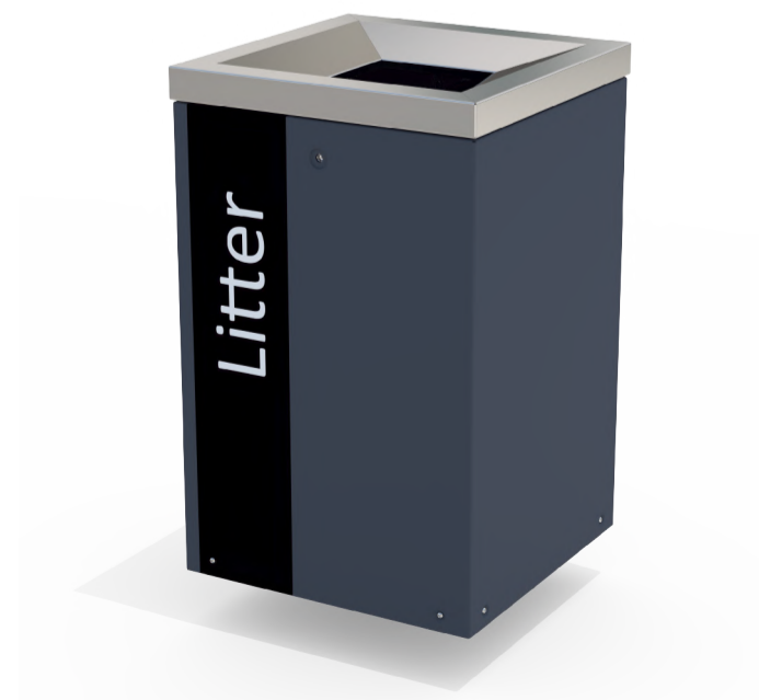
Mobilia Single Bin